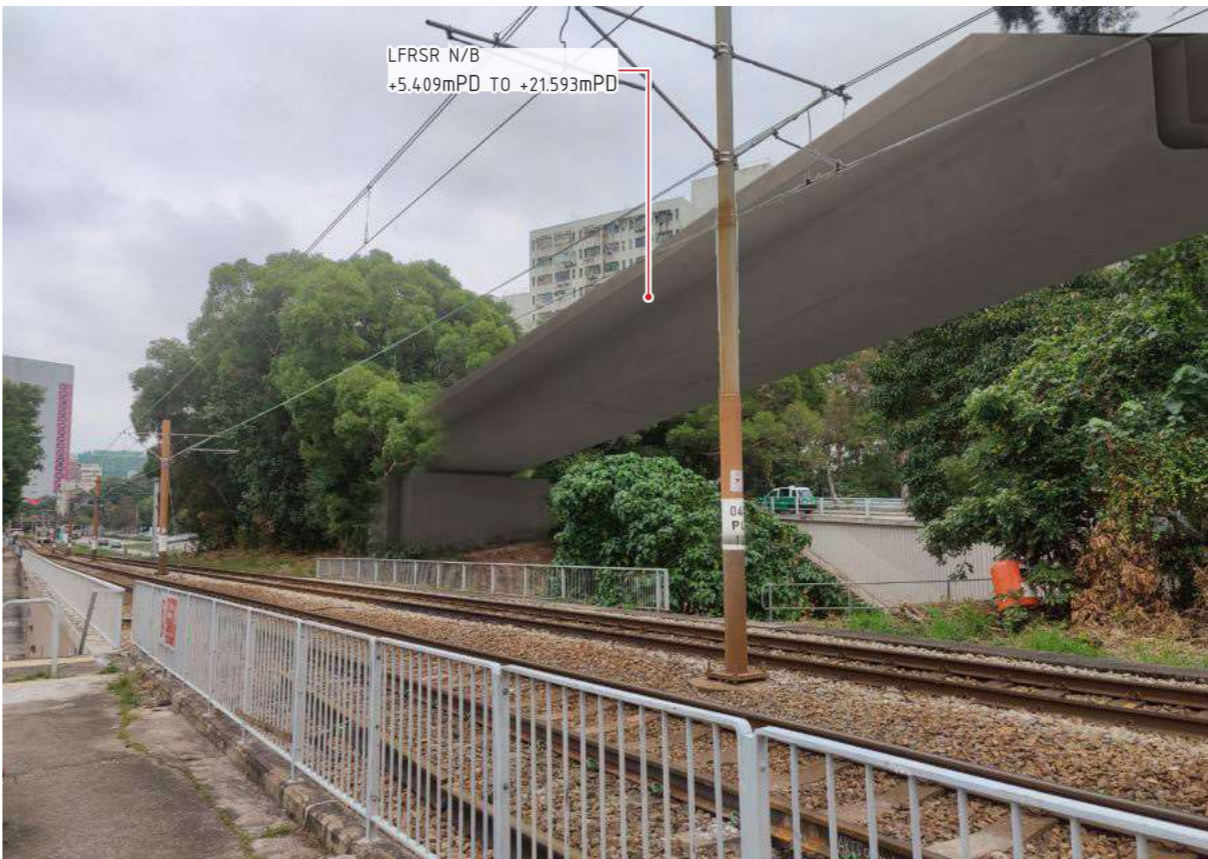
VP04 – PEDESTRIAN FOOTPATH ALONG TSUNG WUN ROAD (NORTHBOUND) - WITHOUT MITIGATION MEASURES