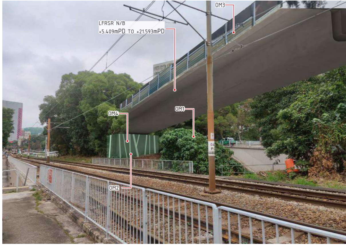
VP04 – PEDESTRIAN FOOTPATH ALONG TSUNG WUN ROAD (NORTHBOUND) - DAY 1 WITH MITIGATION MEASURES