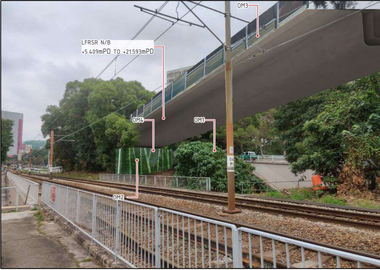
VP04 – PEDESTRIAN FOOTPATH ALONG TSUNG WUN ROAD (NORTHBOUND) - YEAR 10 WITH MITIGATION MEASURES