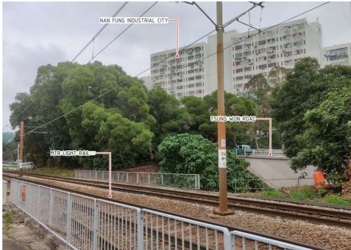
VP04 – PEDESTRIAN FOOTPATH ALONG TSUNG WUN ROAD (NORTHBOUND) - EXISTING SITE CONDITION