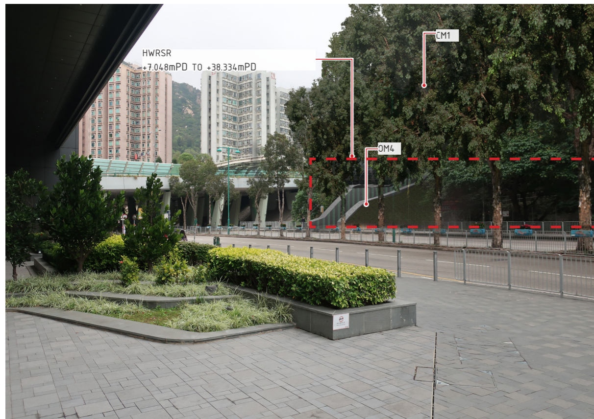
VP05 – SIU LUN COMMUNITY HALL - DAY 1 WITH MITIGATION MEASURES