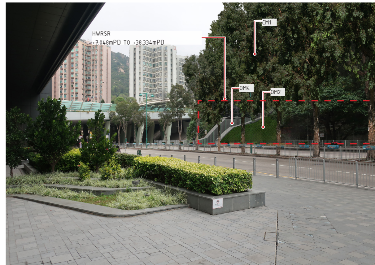
VP05 – SIU LUN COMMUNITY HALL - YEAR 10 WITH MITIGATION MEASURES