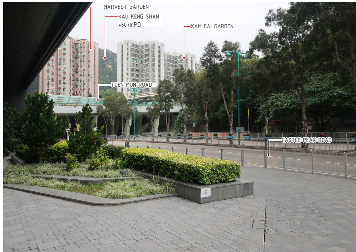
VP05 – SIU LUN COMMUNITY HALL - EXISTING SITE CONDITION