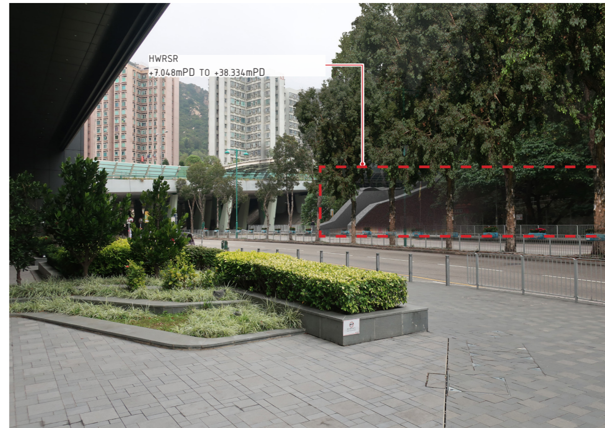
VP05 – SIU LUN COMMUNITY HALL - WITHOUT MITIGATION MEASURES