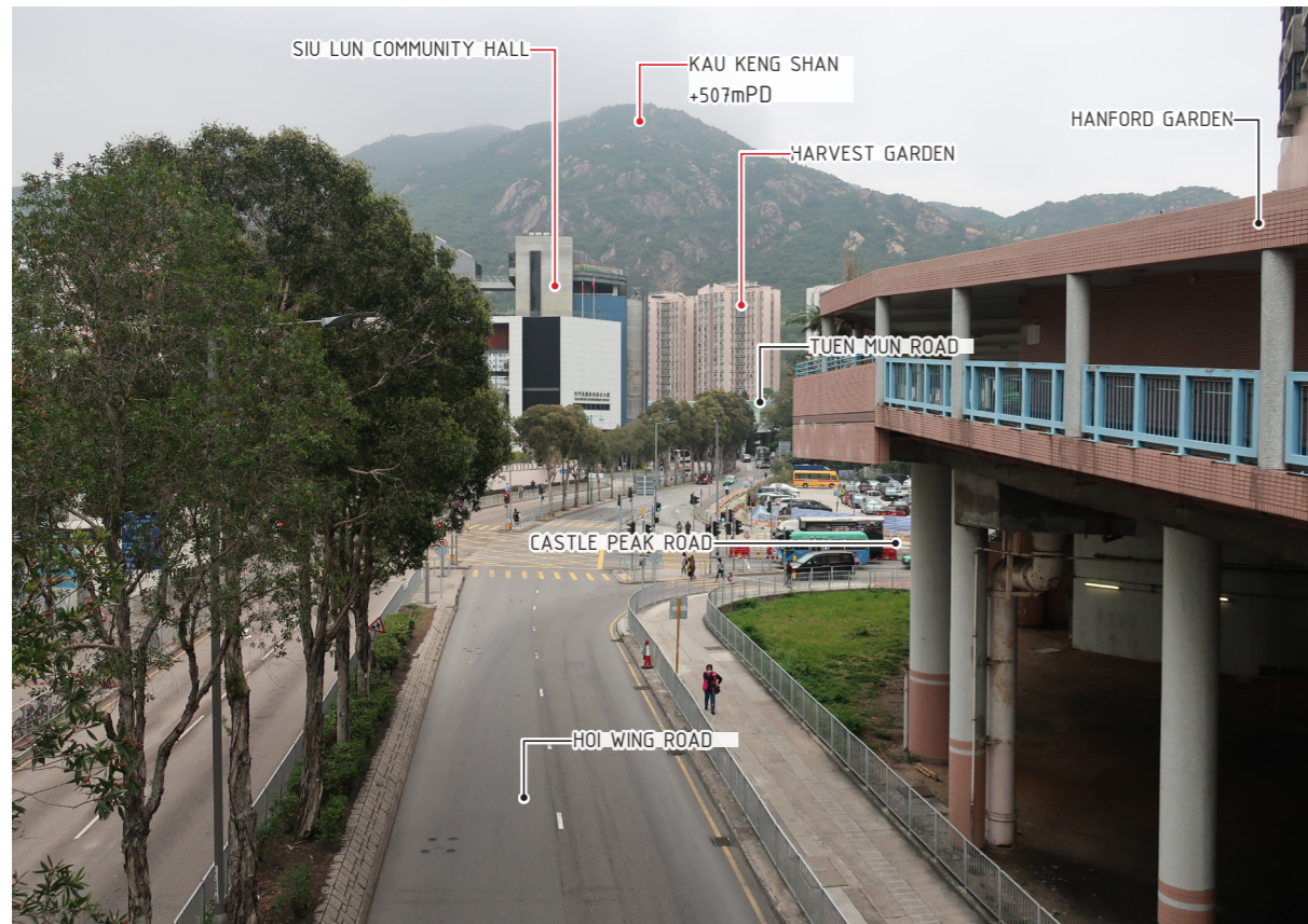
VP06 – FOOTBRIDGE ON HOI WING ROAD - EXISTING SITE CONDITION