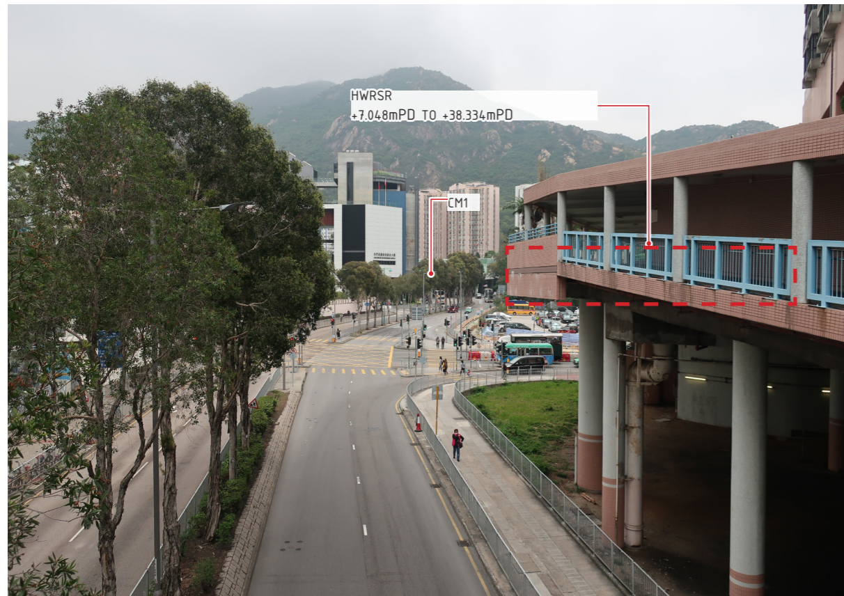
VP06 – FOOTBRIDGE ON HOI WING ROAD - DAY 1 WITH MITIGATION MEASURES