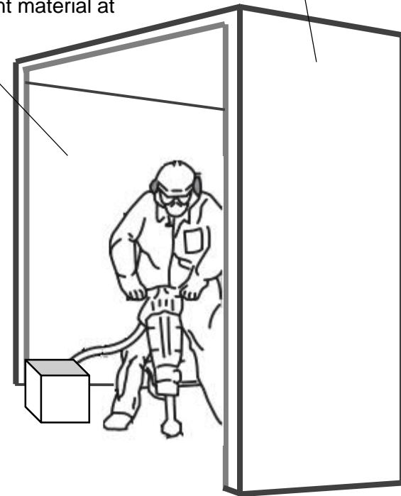
Typical Configuration of Portable Noise Enclosure (~2m high)

Minimum surface density of 14\text{kg/m}^2