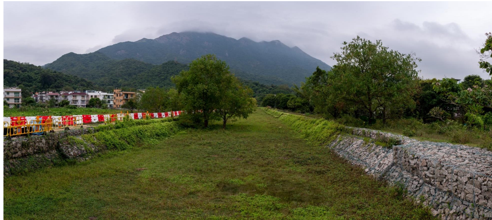
VP2 - Existing conditions