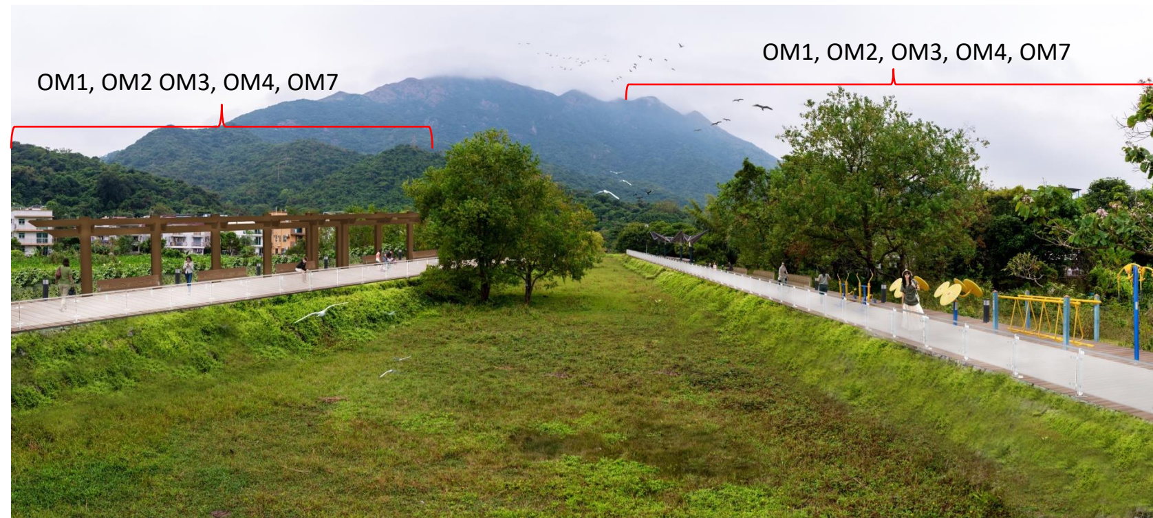
VP2 - Photomontage at Day 1 of operation with mitigation / enhancement