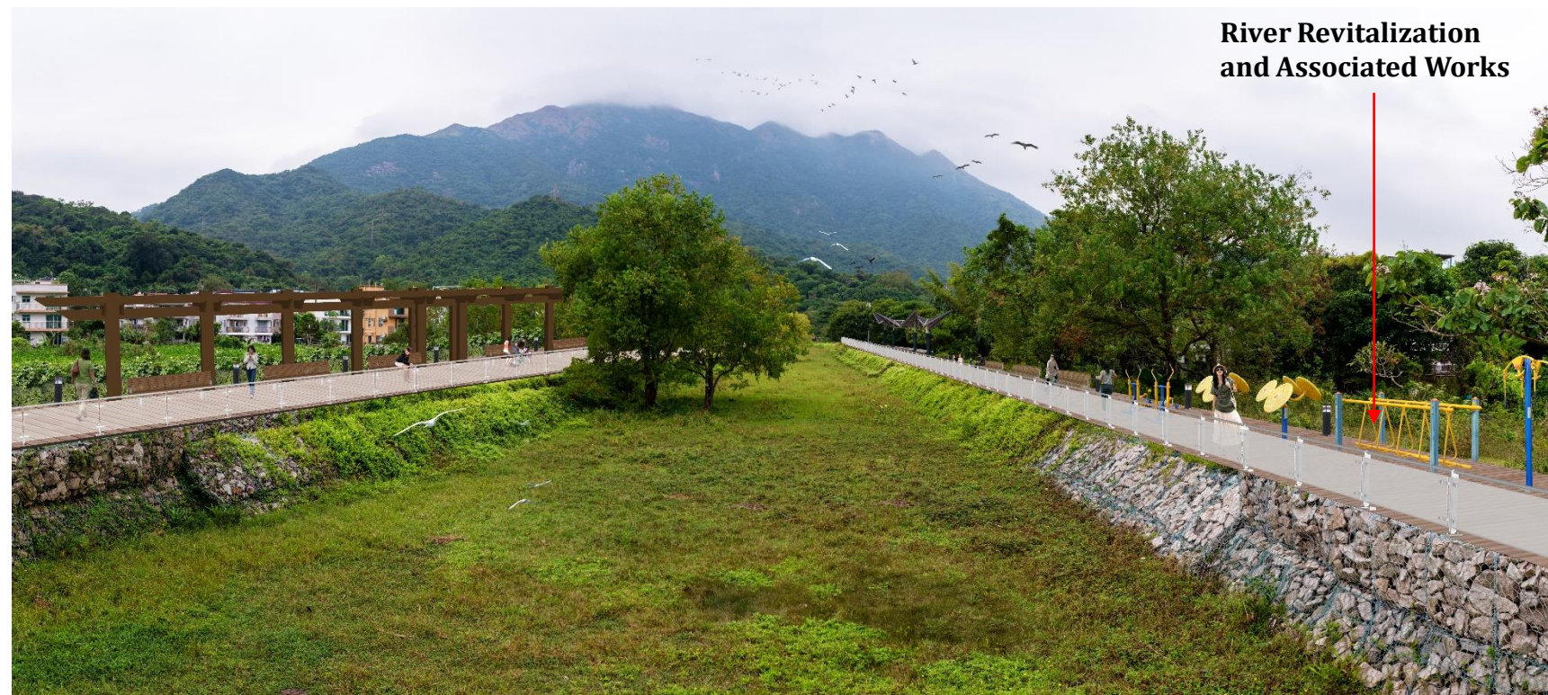
VP2 - Photomontage at Day 1 of operation with no mitigation / enhancement

Notes: The drawing provided aesthetic impression of the indicative form, size and quality of the architectural and landscaping treatment for the landscape features. The final details of layout, material and finishes will be subject to detailed design.