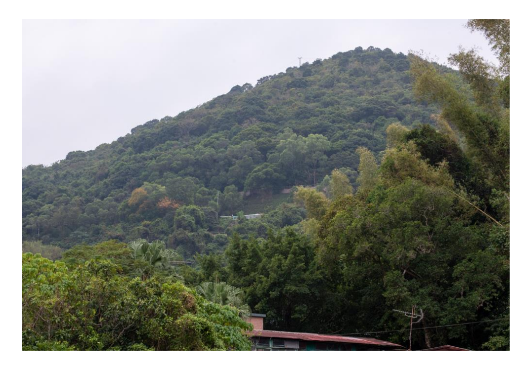
LR 6 - Plantation