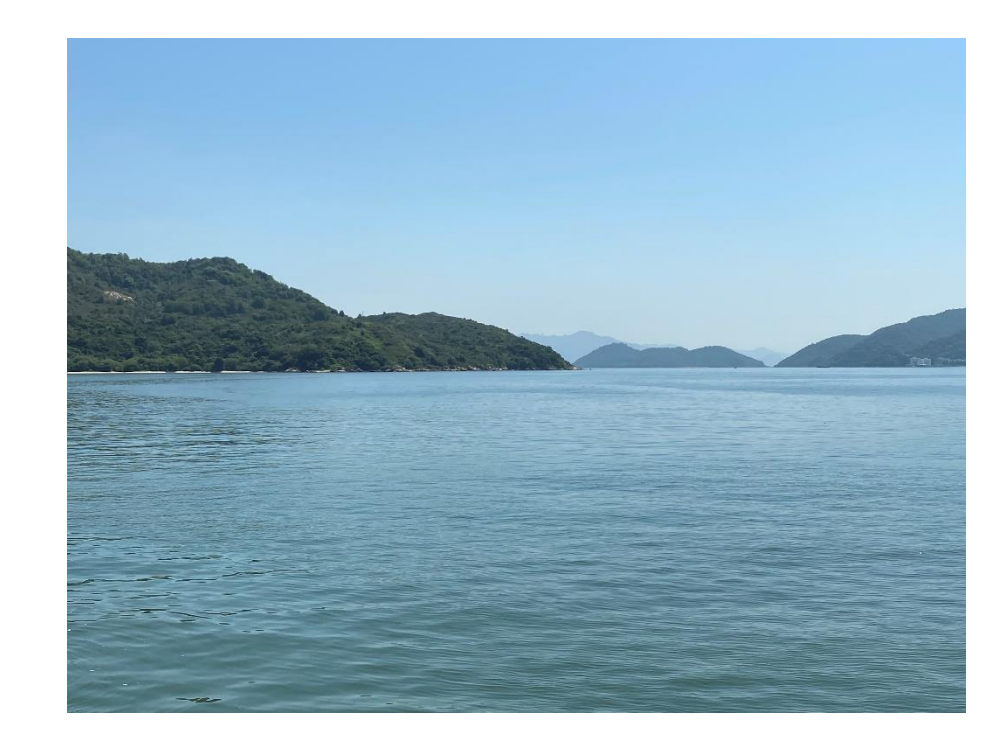
LR 12 - Sea Water