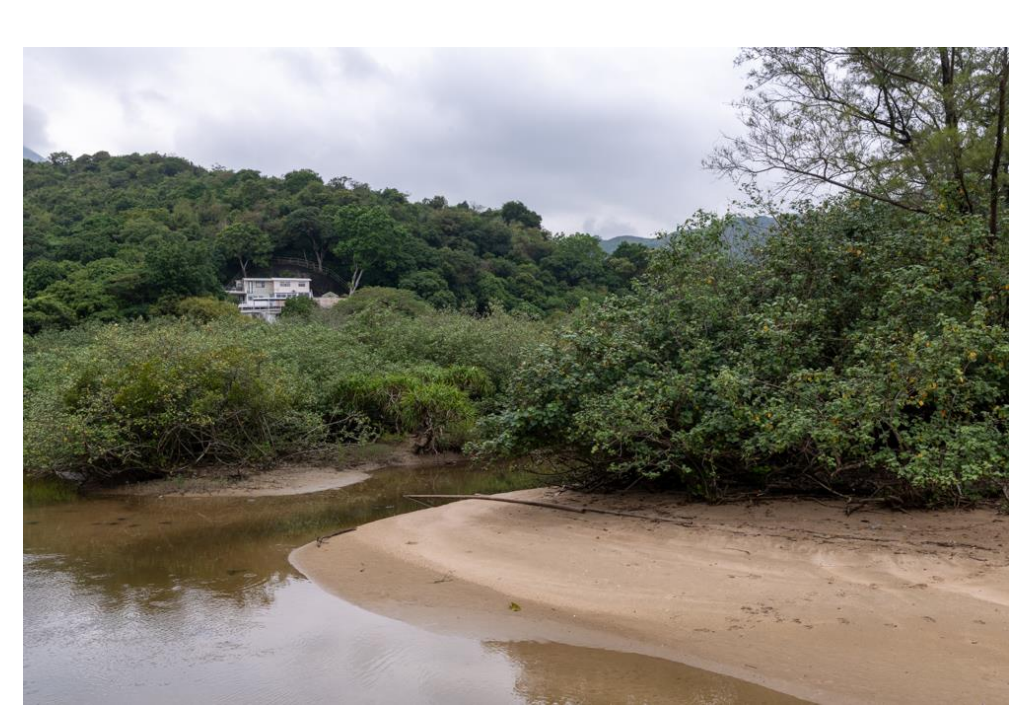
LR 3 - Mangrove