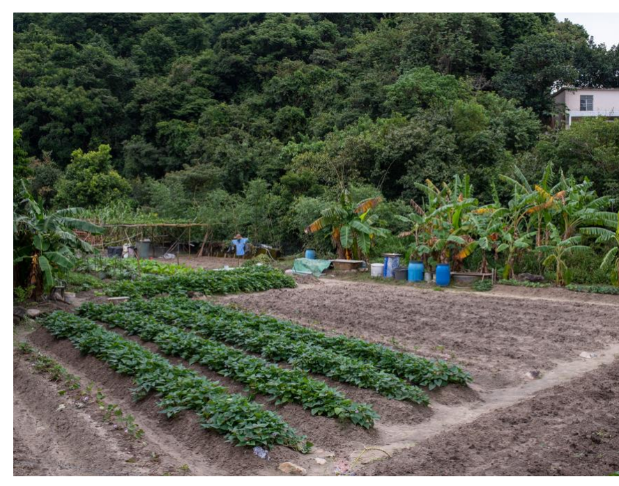
LR 5 - Agricultural Land