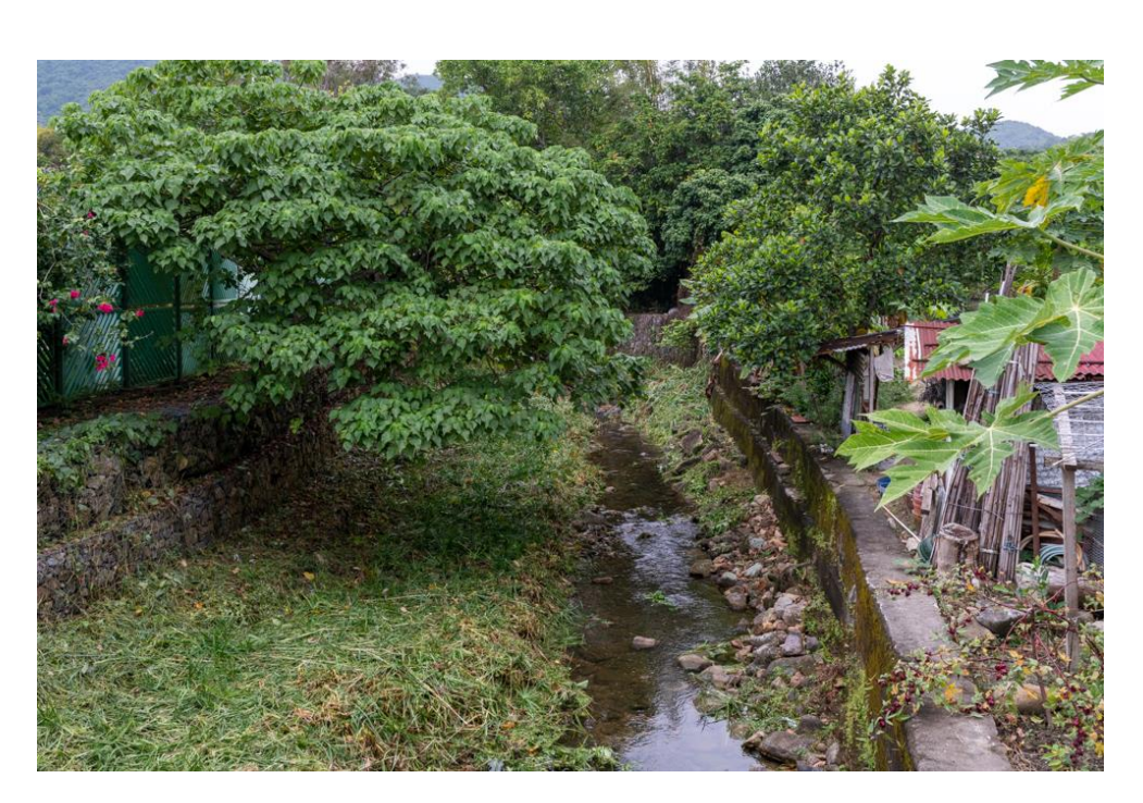
LR 9 - Semi Natural Watercourse