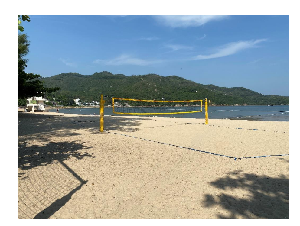
LR 11 - Sandy Shore