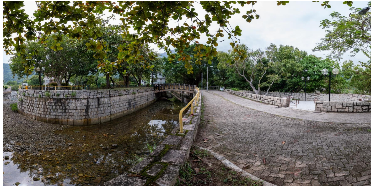
VP1 - Existing conditions