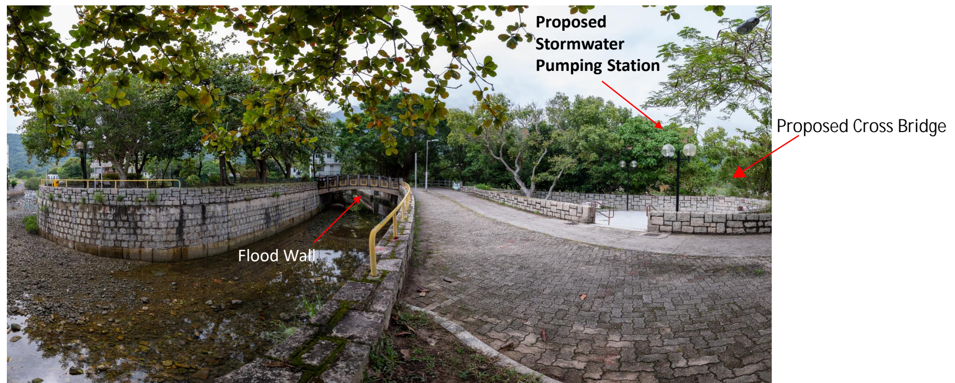
VP1 - Photomontage at Day 1 of operation with no mitigation / enhancement

Notes: The drawing provided aesthetic impression of the indicative form, size and quality of the architectural and landscaping treatment for the landscape features. The final details of layout, material and finishes will be subject to detailed design.