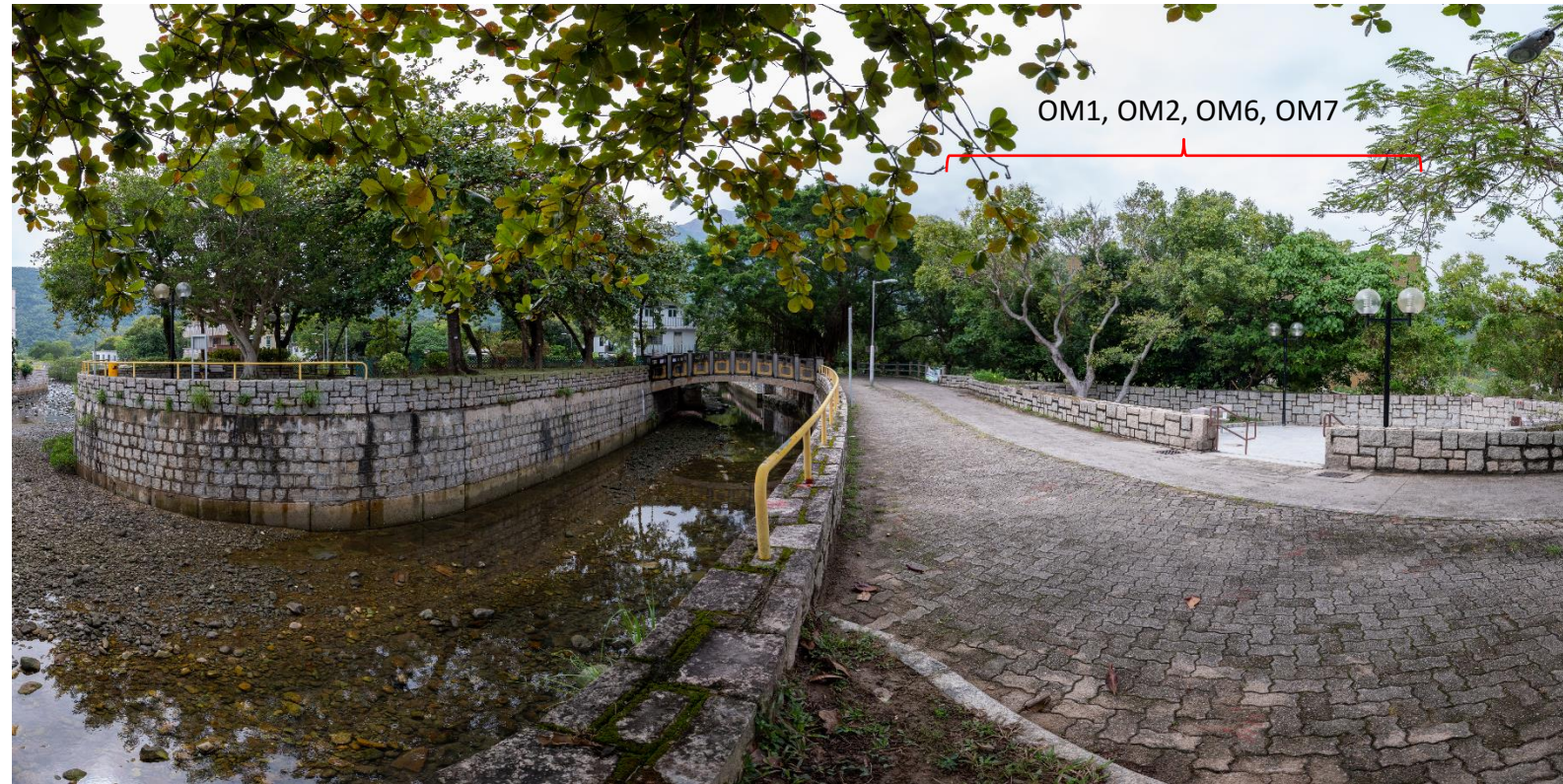
VP1 - Photomontage at Day 1 of operation with mitigation / enhancement