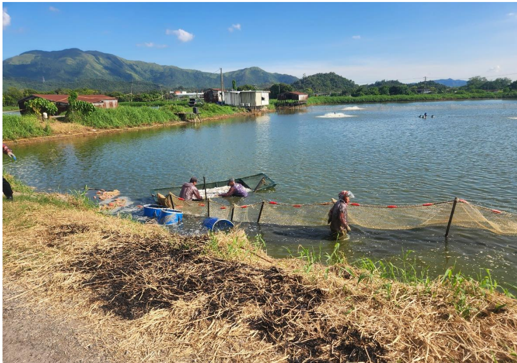
Active Fishponds at San Tin (outside Project boundary)