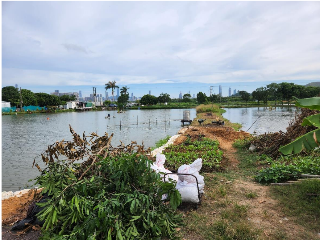
Active Fishponds at San Tin (within Project boundary)