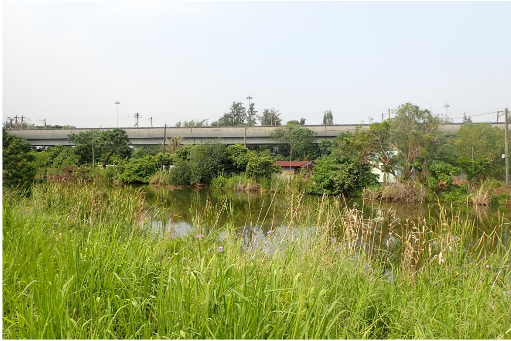
Inactive Fishponds at Lok Ma Chau (within Project boundary)