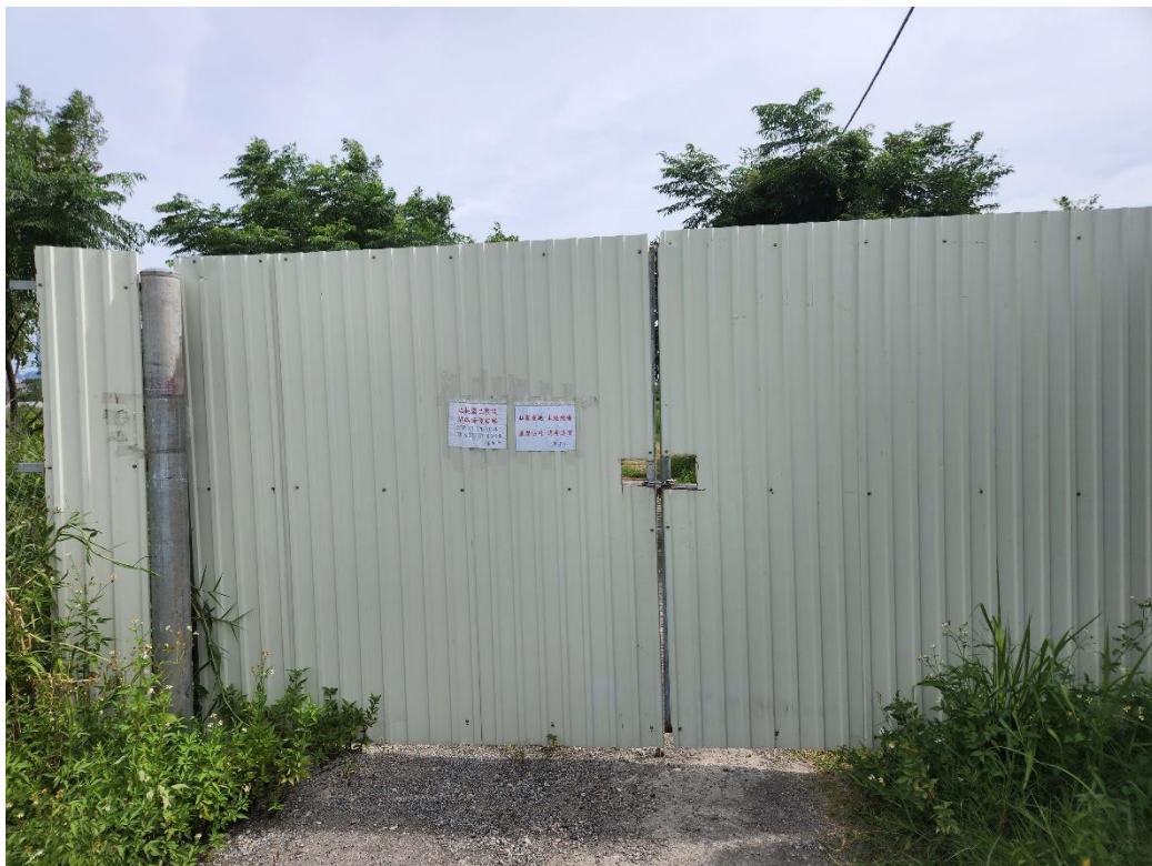
Abandoned Fishponds at San Tin (Sam Po Shue), subsequently fenced off (outside Project boundary)