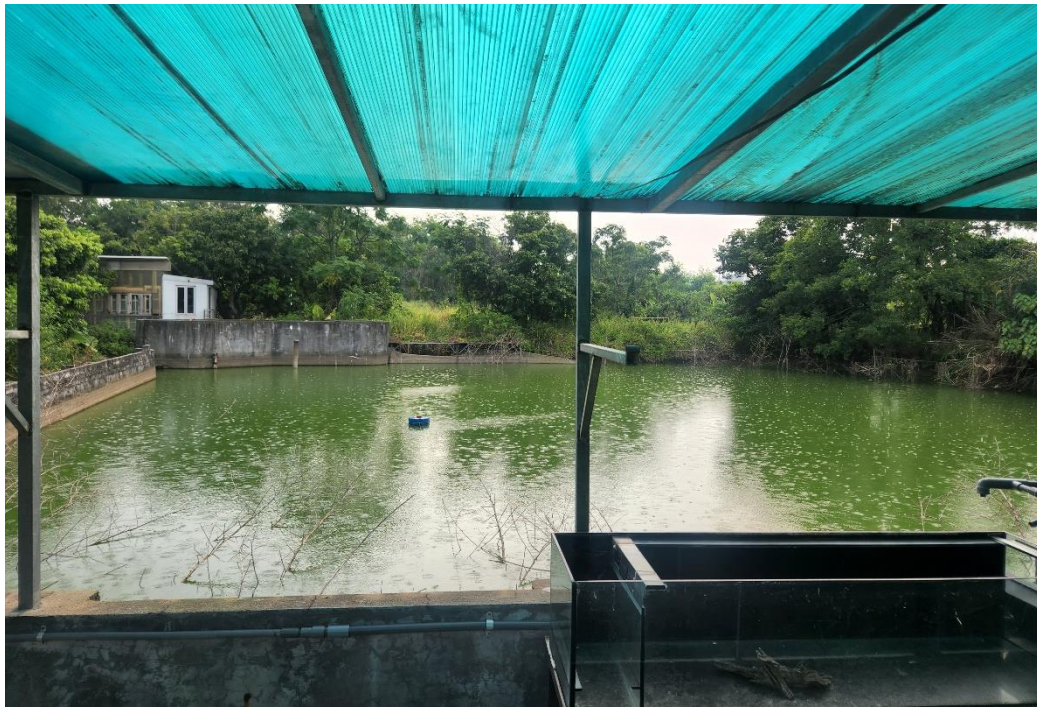
Active Fishponds at Shek Wu Wai (within Project boundary)