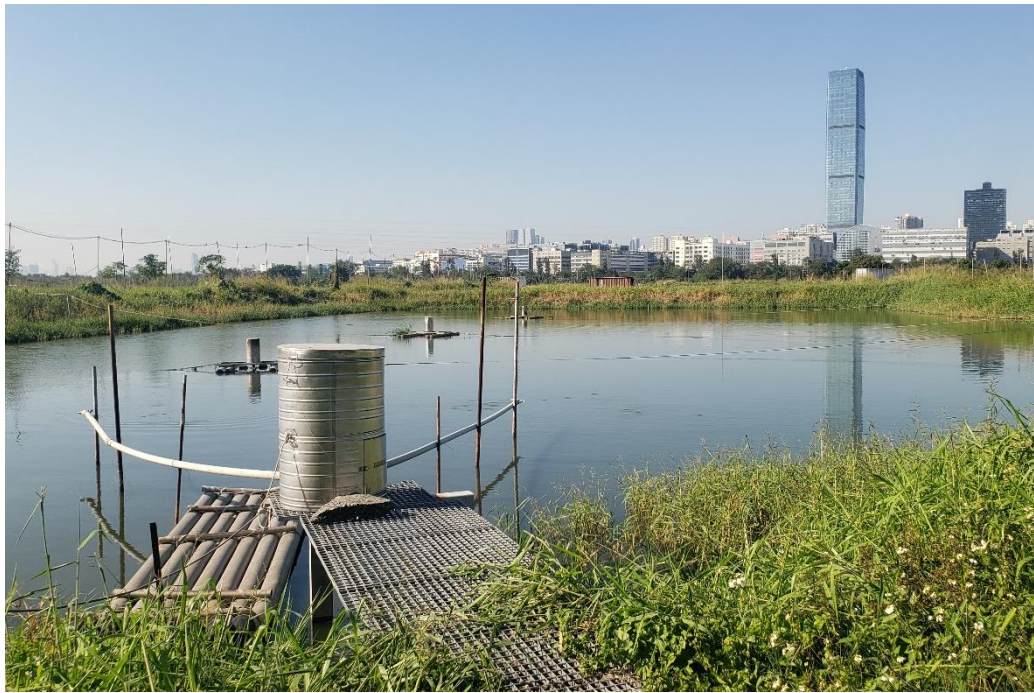
Active Fishponds at San Tin (Mai Po) (outside Project boundary)