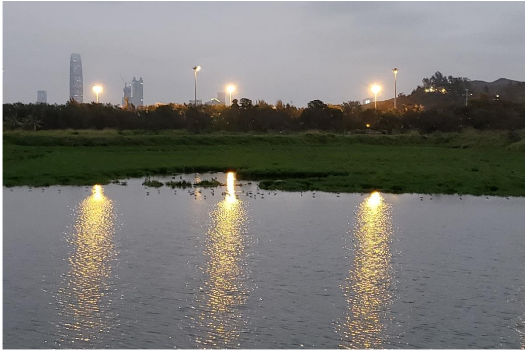
Abandoned Fishponds at San Tin (Sam Po Shue) (outside Project boundary)