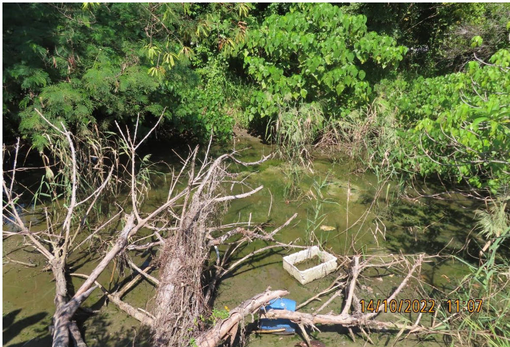
Abandoned Fishponds at Shek Wu Wai (within Project boundary)