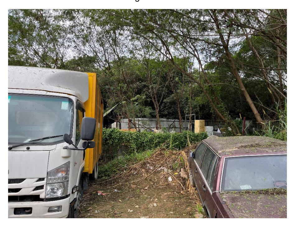
Photo A7.2 Footpath to Field Scanning Area A7 was blocked by fencing.