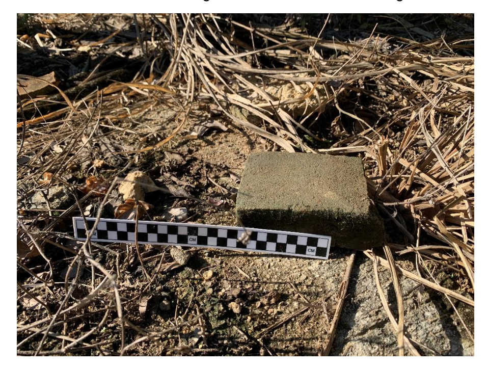
Photo A10.8 Grey brick fragment found in Field Scanning Area A10 among waste deposit