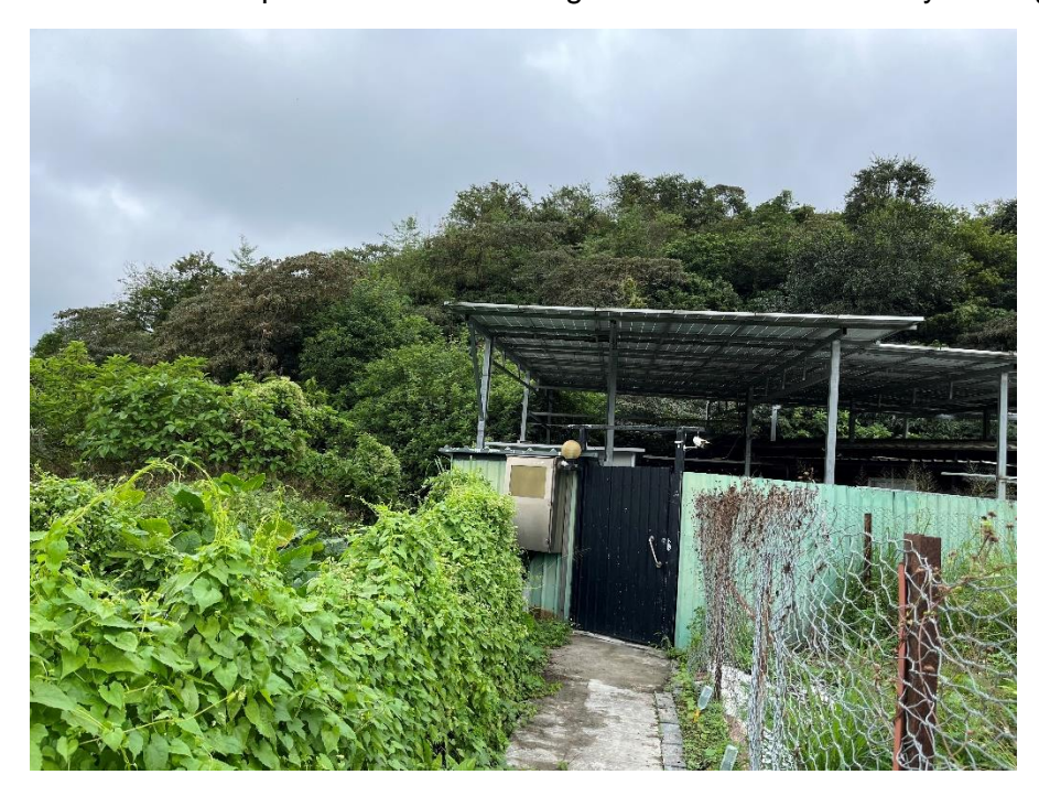
Photo A7.4 Footpath to Field Scanning Area A7 was blocked by temporary structure.