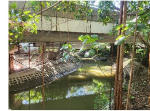
NOTE: EXISTING CULVERT CONNECTING TO STEMDC (LOCATED UNDER SAN SHAM ROAD), WITH FENCING AS MAMMAL BARRIER