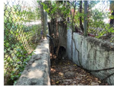
NOTE: EXISTING WILDLIFE CORRIDOR ACROSS LOK MA CHAU ROAD, WITH FENCING AS MAMMAL BARRIER