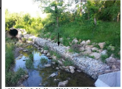
NOTE: EXAMPLES OF WATERCOURSE WITH CABION RIVERBANK