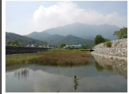
ABOVEGROUND WILDLIFE CORRIDOR (WIDTH: 10m) INCLUDING WATERCOURSE WITH CABION RIVERBANK (SUBJECT TO DETAILED DESIGN)