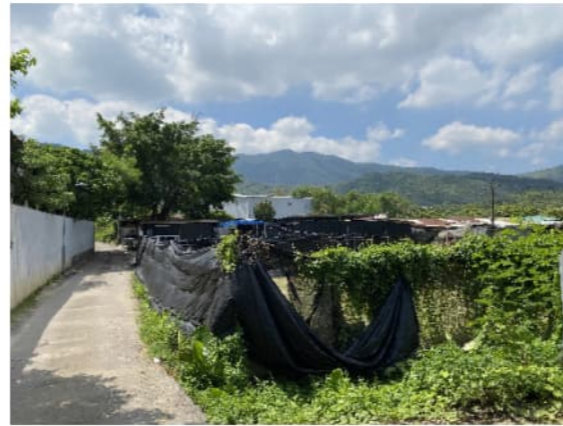
LR9 - DRY AGRICULTURAL LAND