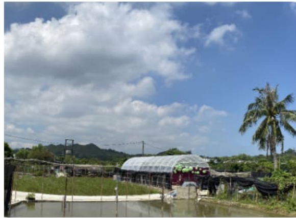
LR8 - WET AGRICULTURAL LAND