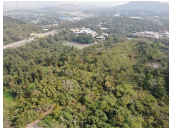
LR12.1 - PLANTATION ON SLOPE