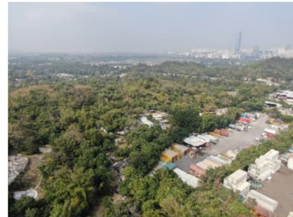
LR11 - MIXED WOODLAND