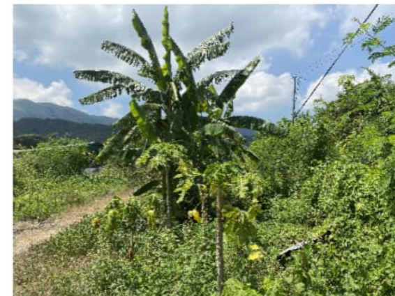
LR15 - VILLAGE/ ORCHARD