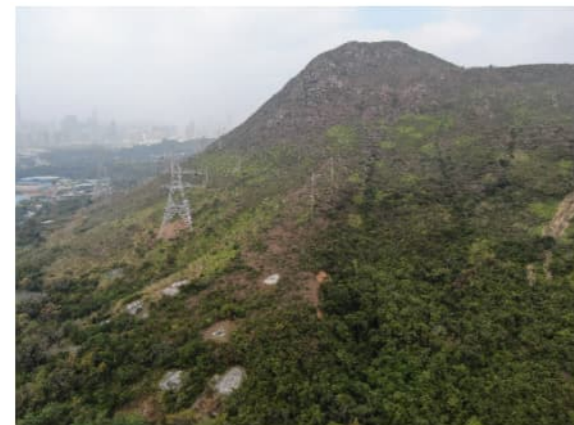
LR13 - SHRUBLAND