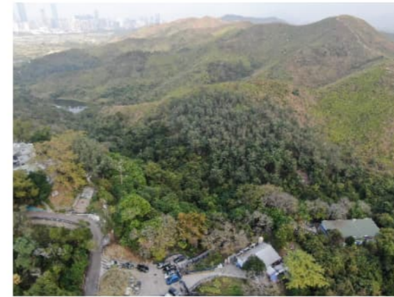
LR10 - WOODLAND