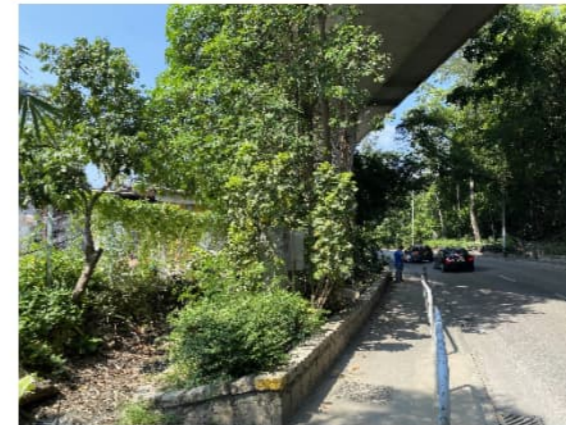
LR12.2 - PLANTATION ALONG ROADSIDE