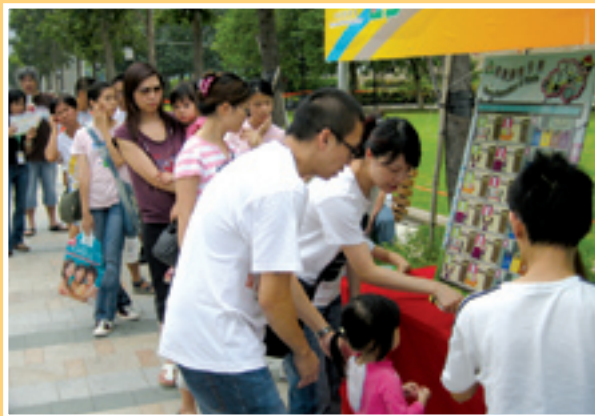
Game booths were set up to educate children about source separation of waste.