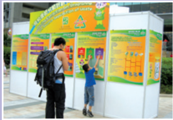
Roving exhibitions were organised in various districts.