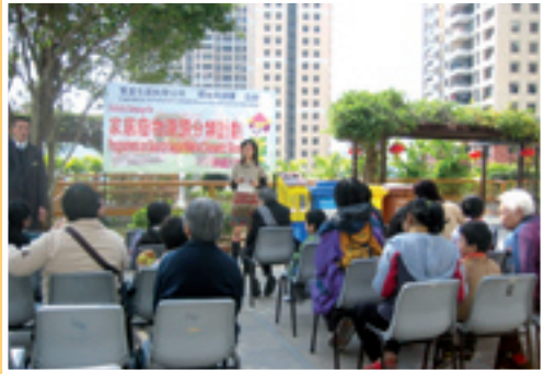
Talks were given to residents of participating housing estates.