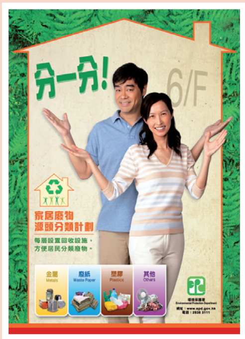
家居廢物源頭分類計劃宣傳海報 Promotion poster for the Programme on Source Separation of Domestic Waste