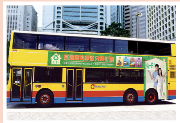
在公共交通工具上張貼宣傳廣告 Advertisement on public transport