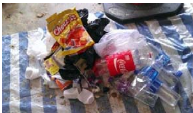
Dragon Boat Festival