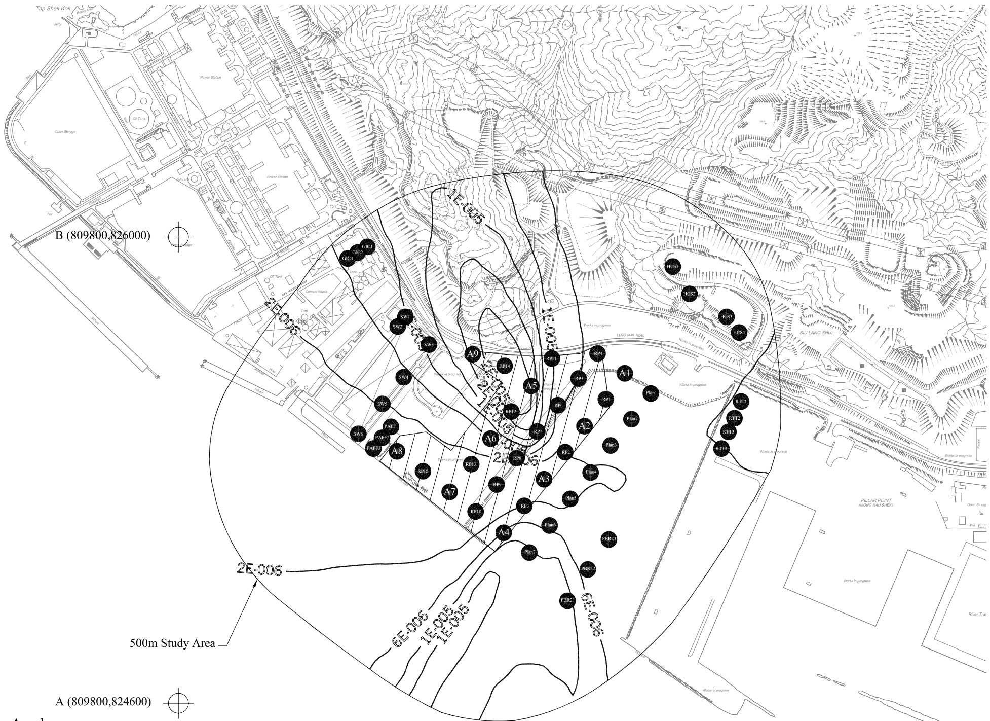
Scale: As shown Figure 7-F4 Cumulative Cancer Risk at 22.5mPD (Mitigated Scenario 2)