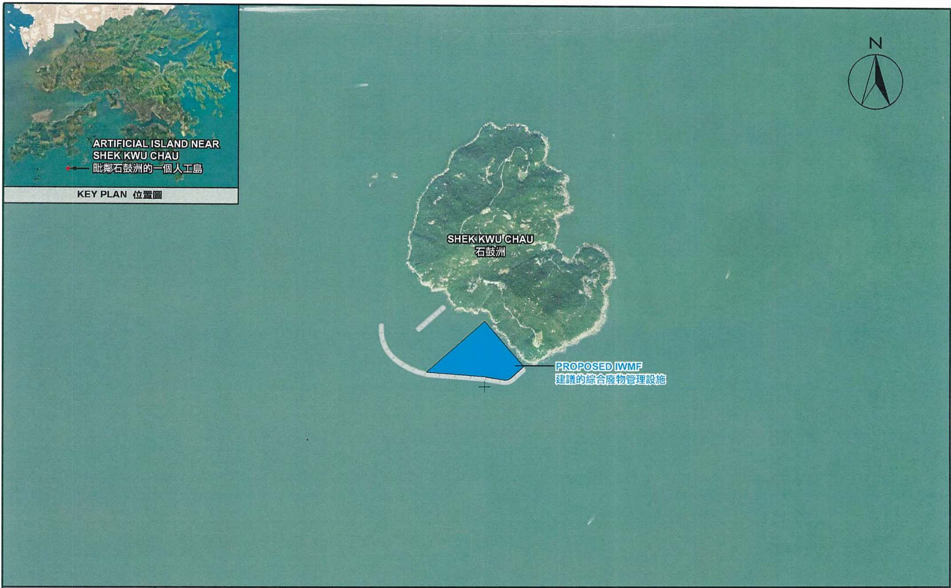
Project Title : Integrated Waste Management Facilities (IWMF) – Phase 1 Figure 2 Location of the IWMF at the Artificial Island near Shek Kwu Chau (Reproduced from Figure ES2 of the Executive Summary of the EIA Report)