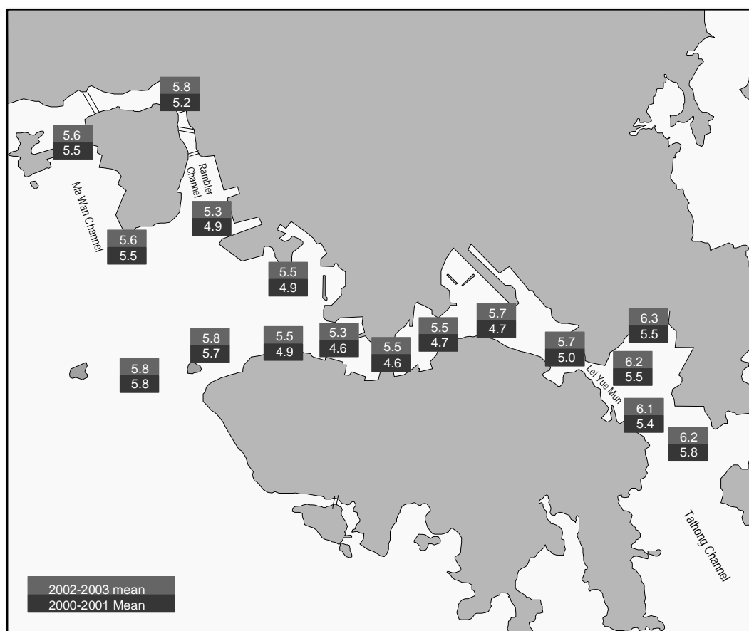
Figure 2 Map showing changes in dissolved oxygen (mg/L) at 17 stations in the HATS enhanced monitoring (comparison of mean difference between Jan 2002 – Dec 2003 and Jan 2000 – Dec 2001)