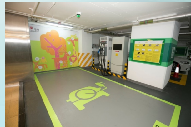
Cityplaza at Taikoo Shing

The two power companies have set up public charging facilities including medium and fast chargers on Hong Kong Island, Kowloon and the New Territories.