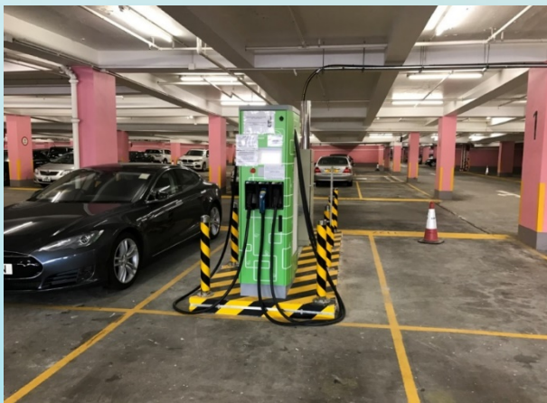
Hong Kong International Airport (Car Park 4)