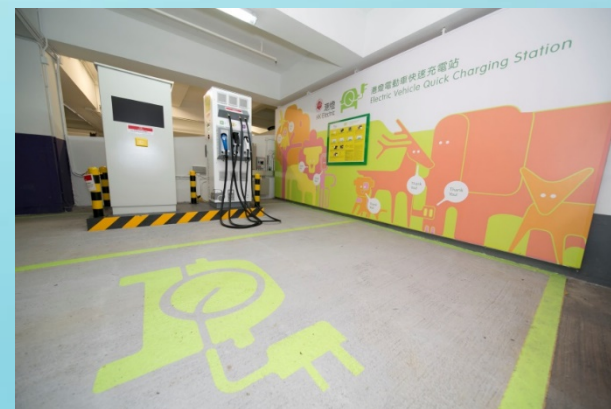
Hing Wah Estate