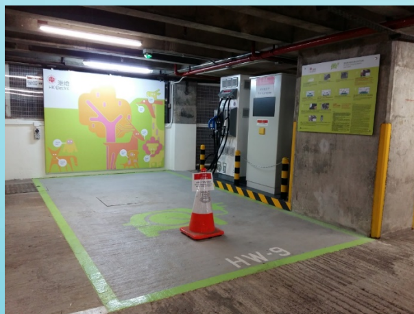
The University of Hong Kong