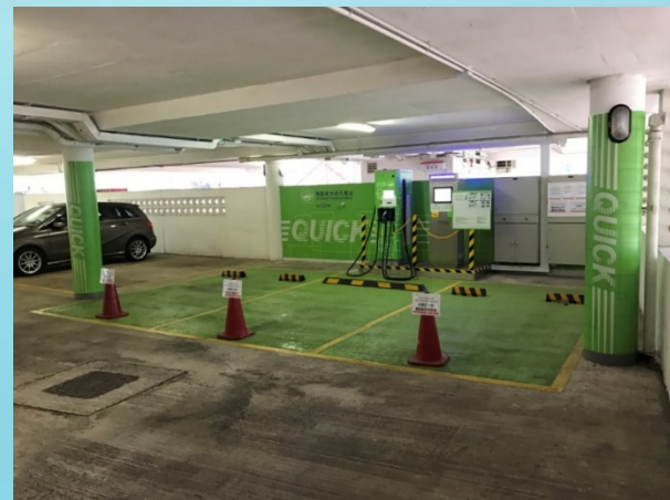
Jockey Club Kau Sai Chau Golf Course Public Car Park