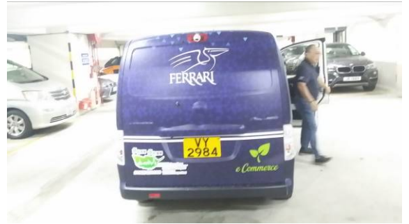
EV-2 – rear view