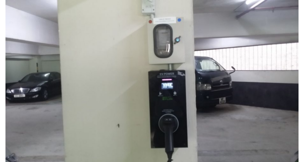
EV-2 – EV charger