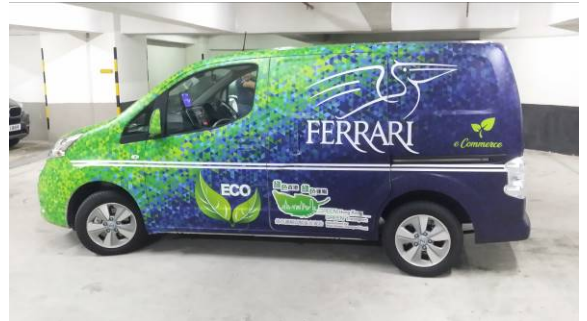
EV-2 – left side view