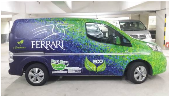
EV-2 – right side view