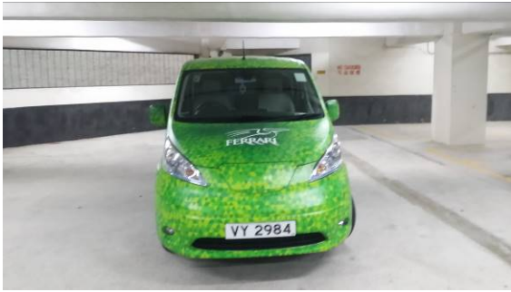
EV-2 – front view