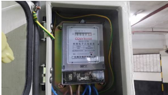
EV-2 – watt-hour meter