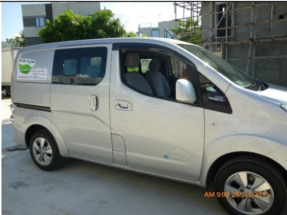
EV – right side view