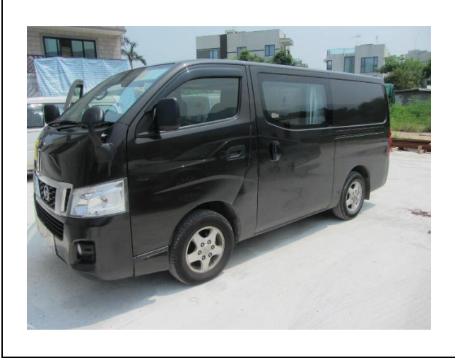
DV left side view