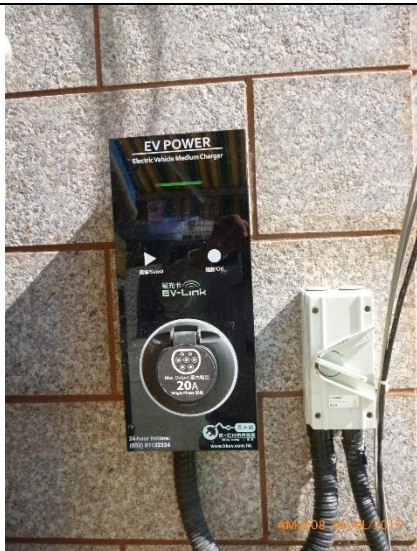
Charger at the EV owner's office