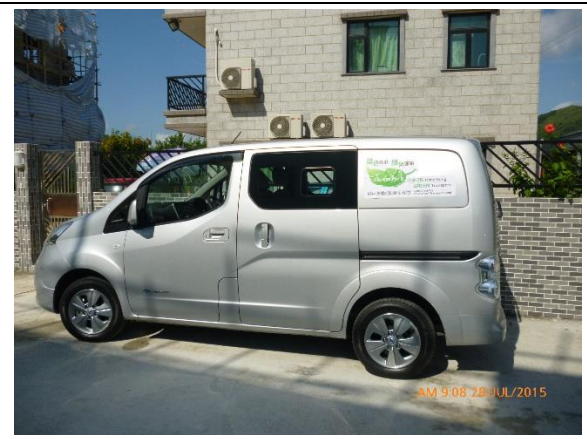
EV – left side view