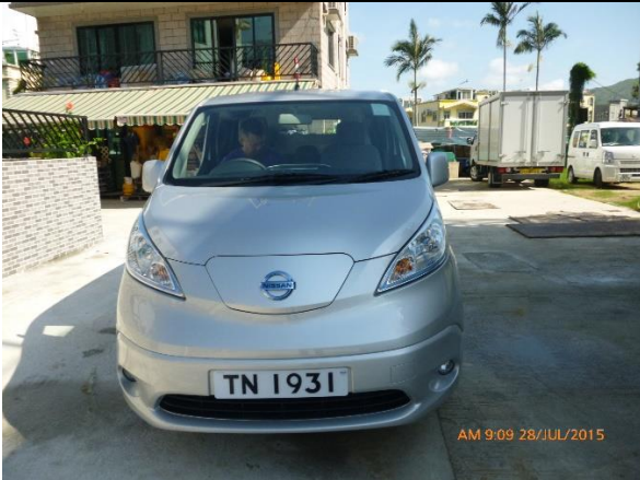
EV - front view