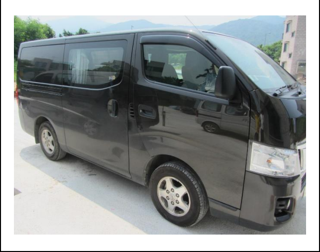
DV right side view