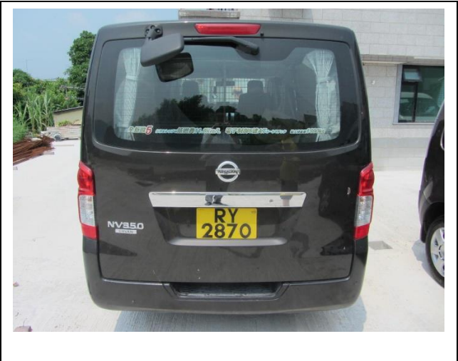
DV rear view