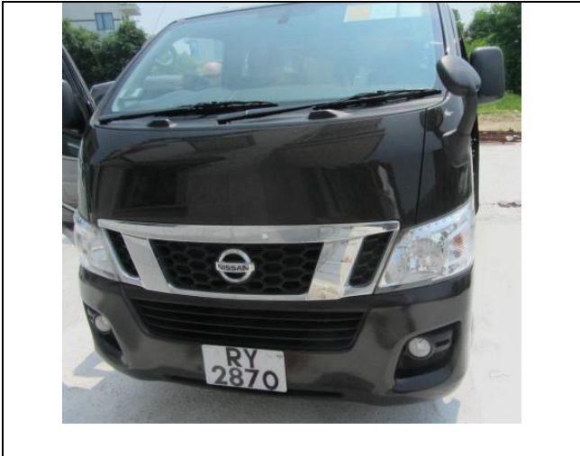
DV front view