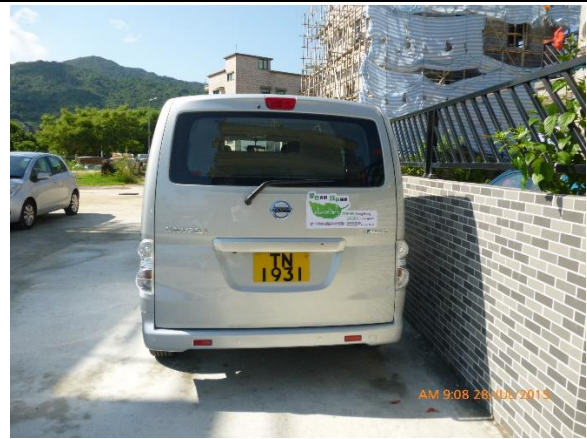
EV - rear view