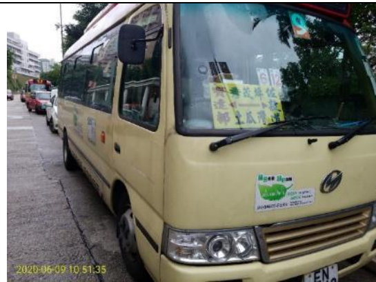
Right side view of HV