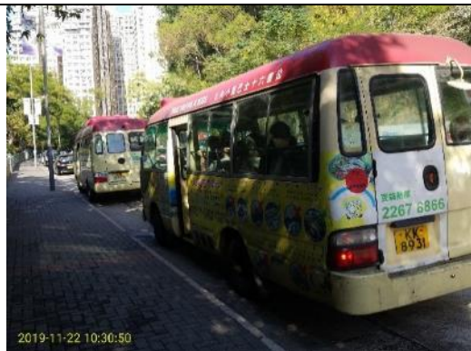
Left Side view of GV (KK8931)