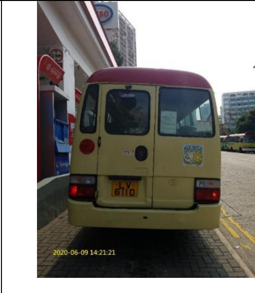
Rear view of GV (LV6110)