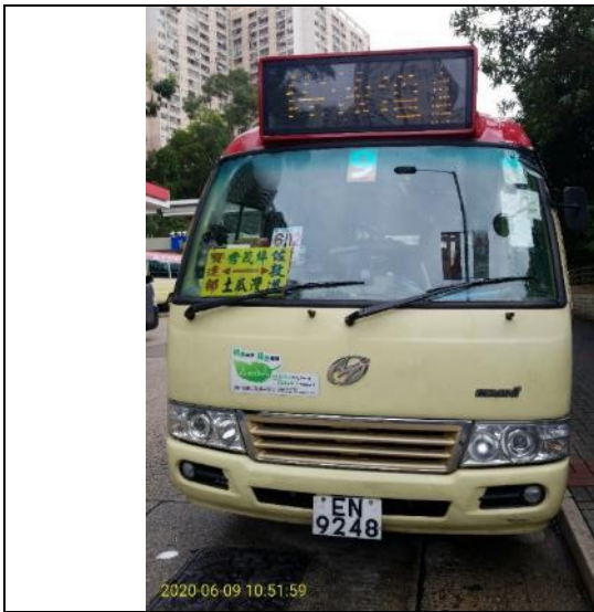
Front view of HV