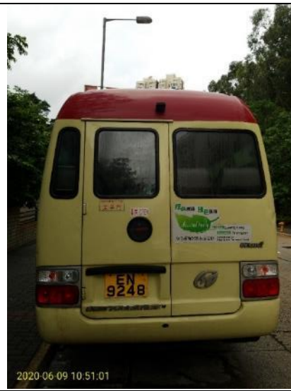
Rear view of HV