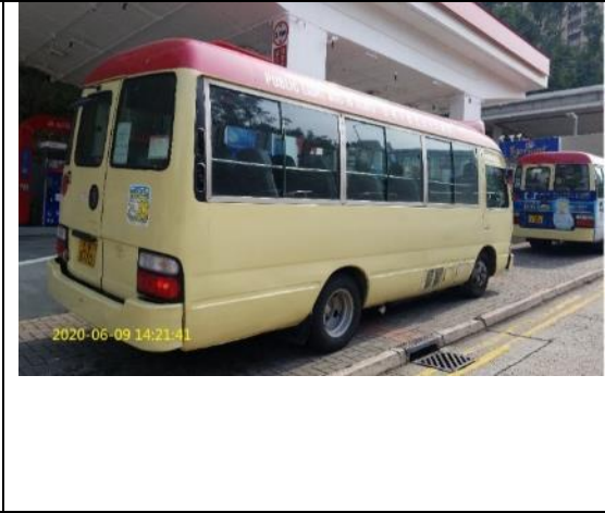
Right side view of GV (LV6110)