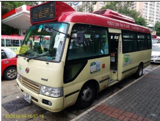
Left side view of HV