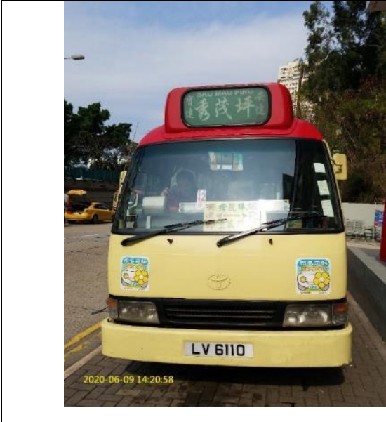
Front view of GV (LV6110)