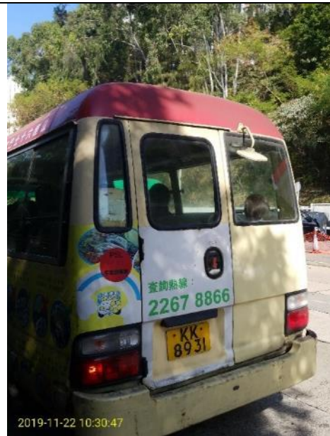
Rear view of GV (KK8931)