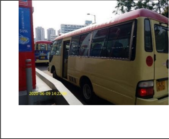
Left side view of GV (LV6110)