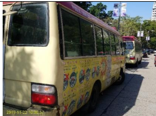
Right Side view of GV (KK8931)