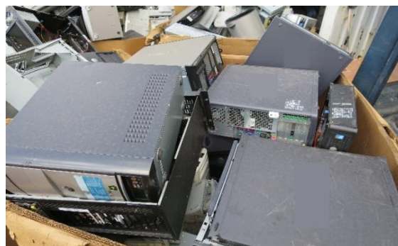
Abandoned waste computer

The Environmental Protection Department may request relevant second-hand e-appliance dealers, waste traders, recycling site operators, importers or exporters to provide proof to show that the “second-hand REE” can be directly re-used, such as: