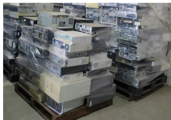
Second-hand computers for reuse

Besides, importers/exporters should produce additional documents, such as sales contracts or invoices, to prove that there are suitable second-hand markets locally or overseas.