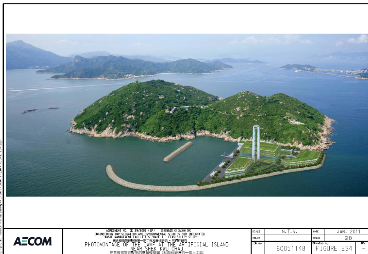
Figure 2 – Photomontage of the IWMF Phase 1 (on the artificial island near SKC) [the visual aspect of the development will be subject to detailed design and we would engage the community in the design process]