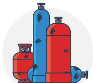
Used compressed gas cylinders