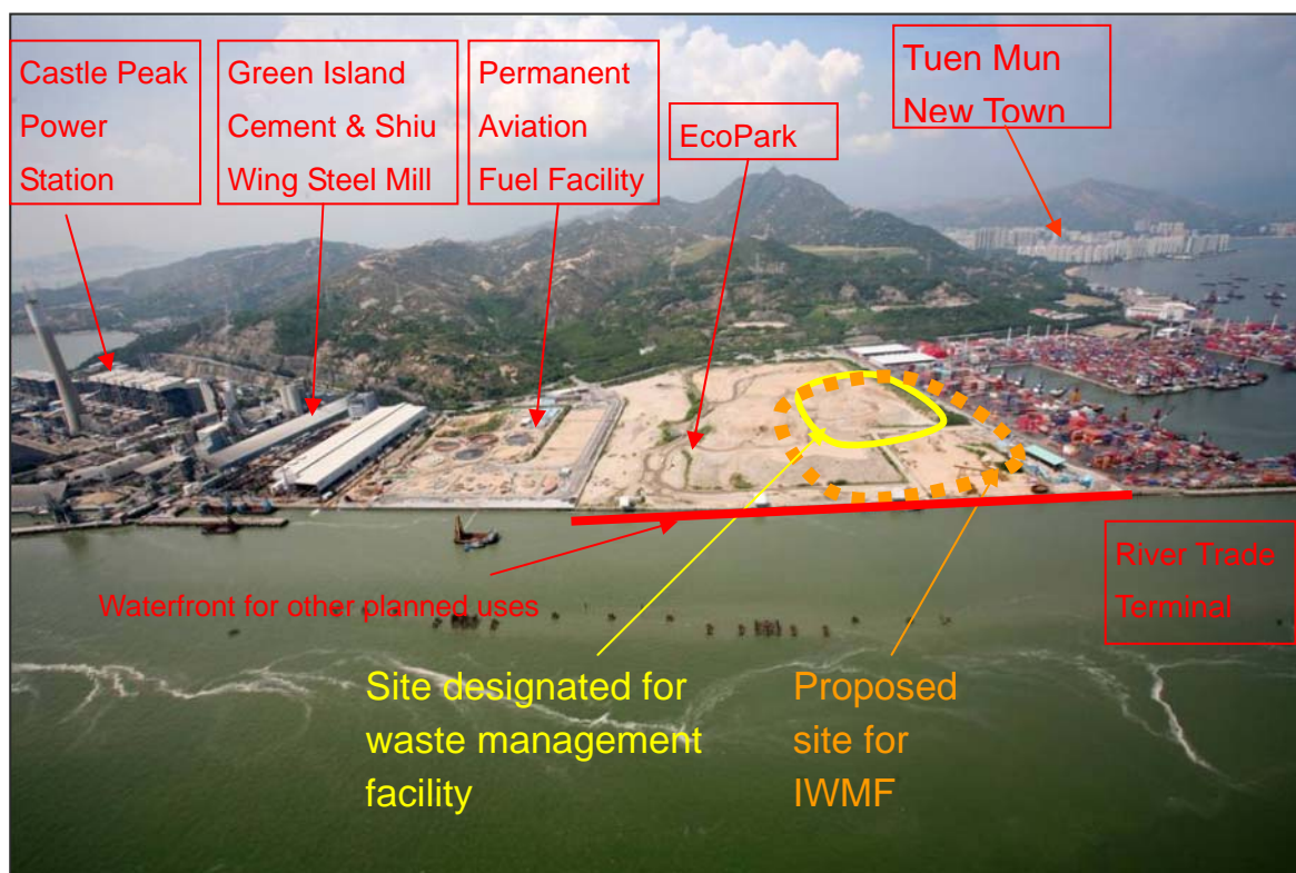
Figure 5 – Aerial View of Tuen Mun Area 38