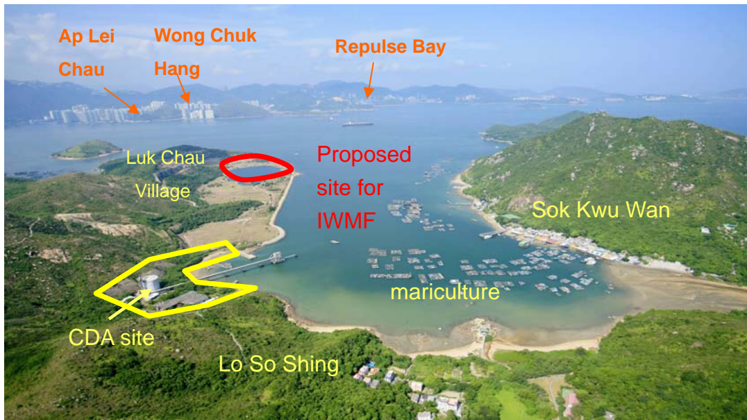
Figure 3 – Aerial View of Ex-Lamma Quarry Site