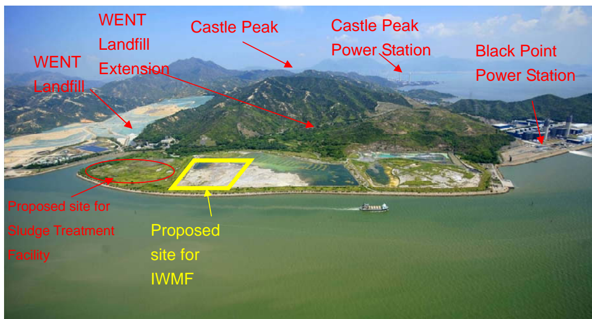
Figure 7 – Aerial view of Tsang Tsui Ash Lagoons

28. The Tsang Tsui Ash Lagoons are situated at the northwest New Territories adjacent to the WENT Landfill and the China Light and Power Company Ltd.'s (CLP) Black Point Power Station. The ash lagoons were constructed in the 1980s by CLP for the purpose of storing pulverized fuel ash (PFA) generated from the Castle Peak Power Station. However, the ash lagoons have not yet been full due to the periodic mining of ash from the site for commercial use. The site is divided by bunds into three approximately equal sized lagoons: the East Lagoon, the Middle Lagoon and the West Lagoon. Consideration is given to use the Middle Lagoon for developing an IW MF. There are several advantages for doing so -