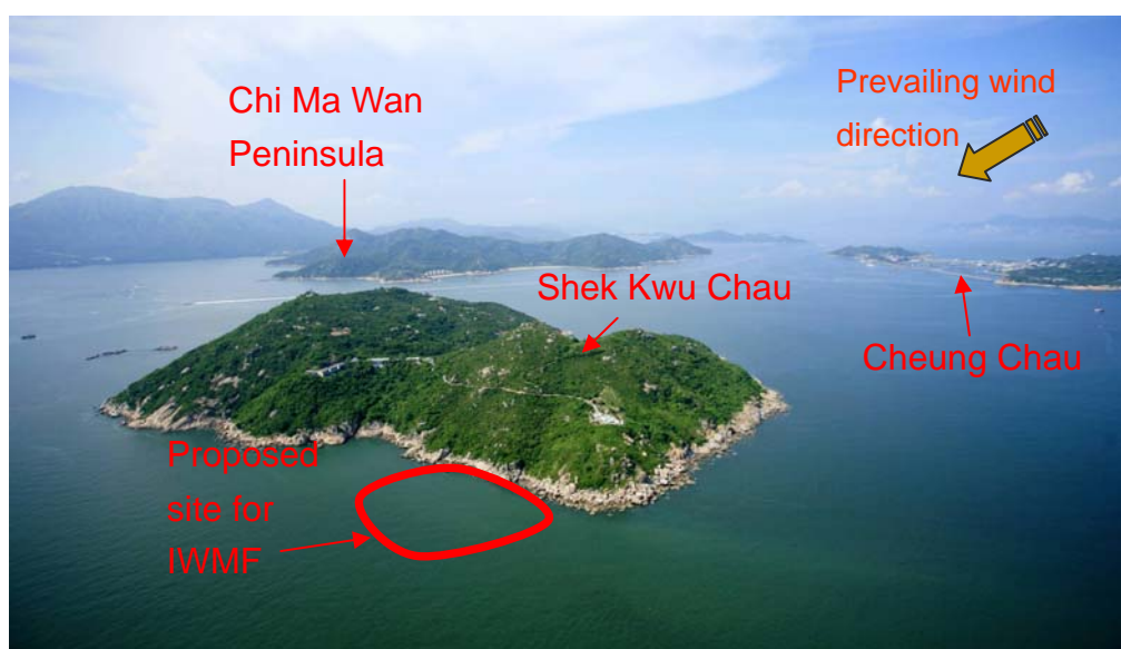
Figure 6 – Aerial view of Shek Kwu Chau