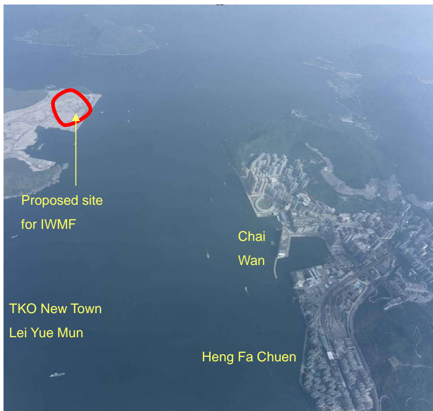
Figure 2 – Aerial View of Tseung Kwan O Area 137