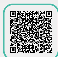
清理化糞池系統承辦商的資料 List of septic tank desludging companies

https://www.epd.gov.hk/epd/sites/default/files/epd/english/environmentinhk/water/guide_ref/files/List_Registered_STD_Companies.doc