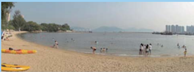
Clean water and clear sky greet swimmers at Castle Peak Beach

Improvement programmes have successfully achieved clean water and made the beach safe for the public to swim.