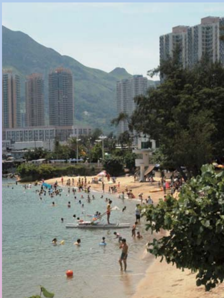
Castle Peak Beach

➤ The water quality of Castle Peak Beach continues to improve after its re-opening in 2005 as shown in its weekly gradings.