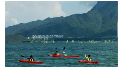
Increased water- sport activities in Tolo Harbour