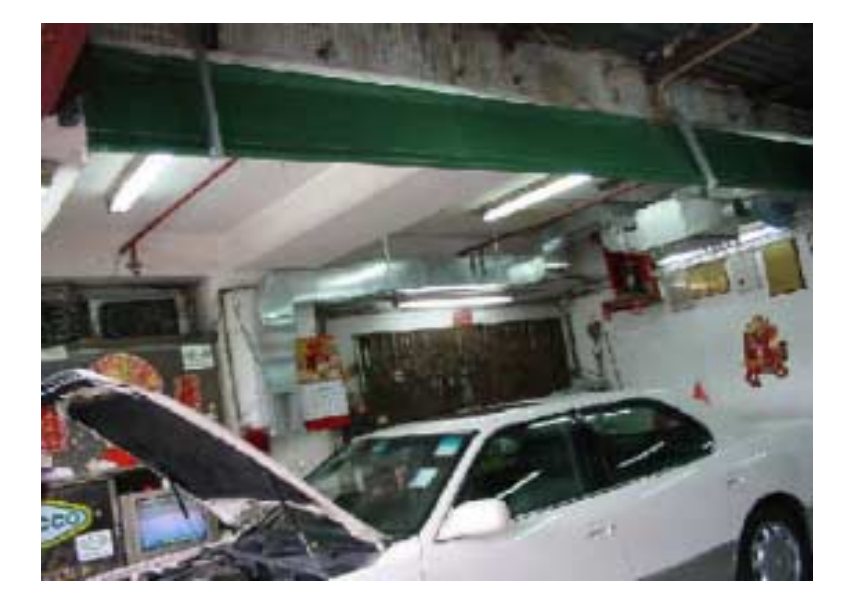
應用於小型維修車房的活性碳除味系統 Real Application in a Small Garage