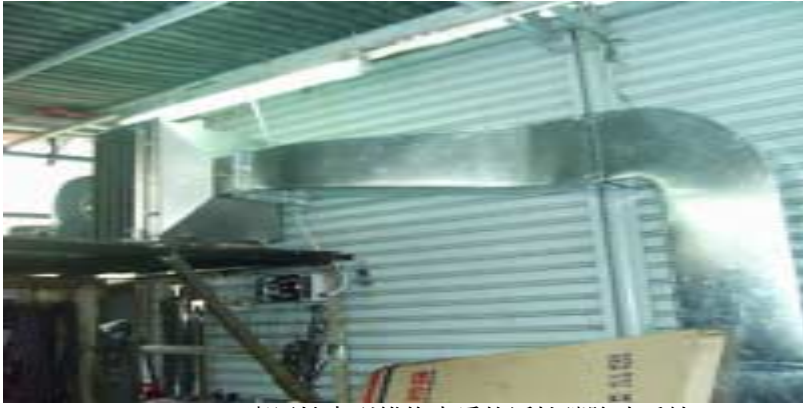
應用於中型維修車房的活性碳除味系統 Real Application in a Medium Garage