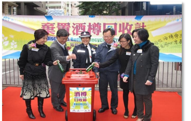
Discarded Bottles Recycling Project