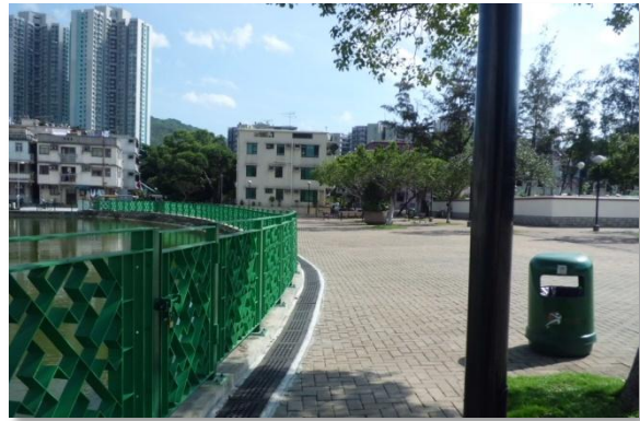
Covered nullah encompassing the fungshui fish pond in Fanling Wai Tsuen