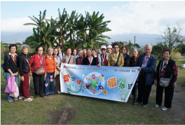
"Cherish our Planet" Project