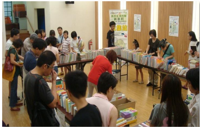
"Old Books & Uniform Recycle Scheme"