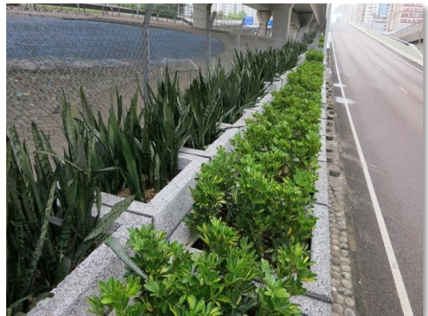
Greening works near flyover areas