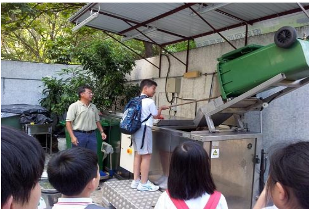
Food Waste Recycling in Yau Tsim Mong Schools Project