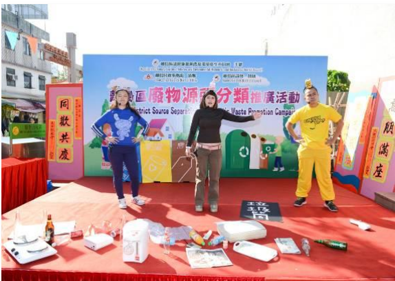
Islands District Source Separation of Domestic Waste Promotion Campaign