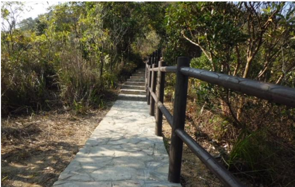
Use of natural stones for the footpath at Needle Hill Country Path

7. HAD carries out minor local improvement works with a view to upgrading the infrastructure and improving the quality of local environment. In support of environmental protection, we include appropriate environmental pollution control clauses in all works contracts. We place emphasis on designing our works projects which helps minimising potential adverse impacts on the natural environment and encourage the use of environmentally friendly materials. Examples include the use of natural stones for the construction of footpath and gabion wall as embankment, etc. During the year, we have also constructed a covered nullah encompassing the fungshui fish pond in Fanling Wai Tsuen to direct sewage away from the fish pond to the proper drainage system.