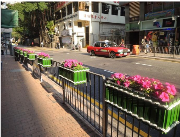
Provision of planters along roadsides

10. We have been working on greening and planting works across various districts by installing and maintaining planters along roadsides and flyover areas. This helps to improve the urban environment not only through achieving air purification and adjustment of climate, but also enhance the overall visual environment for citizens.