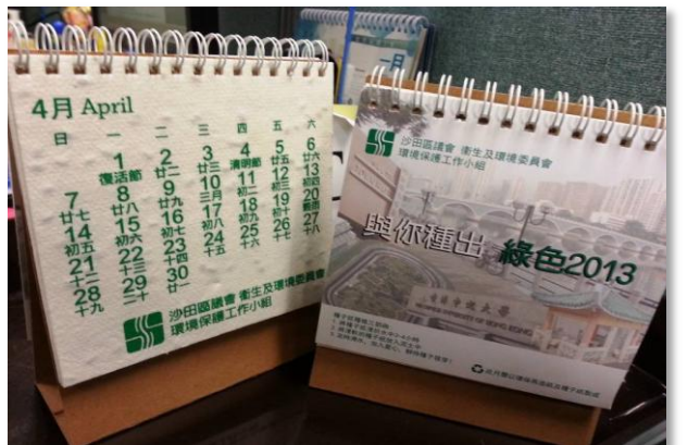
Production of Seeds Calendars