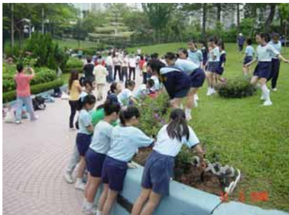
Tree Planting Day for Olympics Organised by Tuen Mun District Council, Tuen Mun District Office and Leisure and Cultural Services Department

8. Apart from our green initiatives in local environment improvement projects, we continue to encourage greening at district level by organising a number of community involvement activities with participation of all sectors of the community, such as tree planting days, workshops on gardening, greening carnivals, programmes on source separation of waste, exhibitions, workshops, seminars, drawing competitions, greening competitions, green bag design competitions, etc.