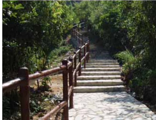
Use of recycled plastics railings for footpath and pavilion at Sai Shan Country Trail, Tsing Yi District