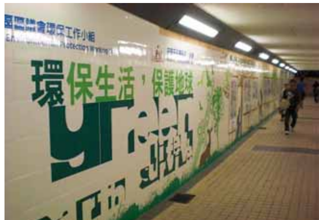
"Green Life, Earth Survival" Drawing and Comics Competition Organised by Southern District Council and Southern District Office