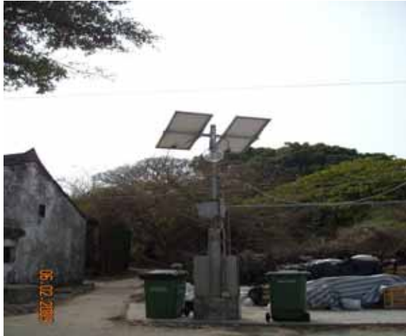
Provision of solar power to HAD village light at Ping Chau (East), Tai Po District

7. HAD carries out minor local improvement works with a view to upgrading the infrastructure and improving the quality of local environment. In support of environmental protection, we include appropriate environmental pollution control clauses into all works contracts. We also use environmentally friendly materials in our minor works projects, e.g. recycled plastics railings, and implement projects on provision of solar energy for lighting.