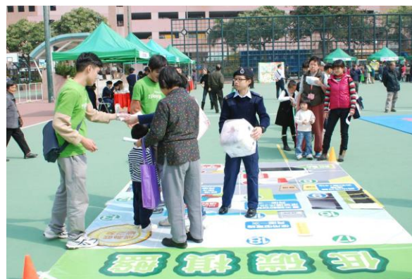
"Low Carbon Living" Carnival organised by Yau Tsim Mong District Council and Yau Tsim Mong District Office