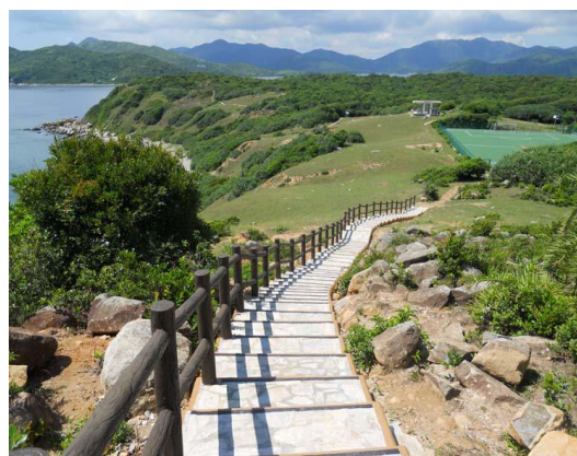
Using natural stones for paving a country trail in Tap Mun, Sai Kung North, Tai Po