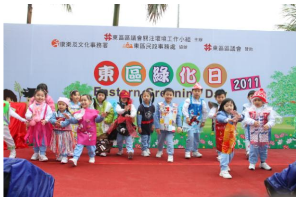
Eastern Greening Day 2011 organised by Eastern District Council and Eastern District Office

8. Apart from our green initiatives in local environment improvement projects, we continue to encourage greening at district level by organising a number of community involvement activities with participation of all sectors of the community, such as tree planting days, workshops on energy saving measures, greening carnivals, green tours, exhibitions, competitions and programmes on source separation of waste, etc.