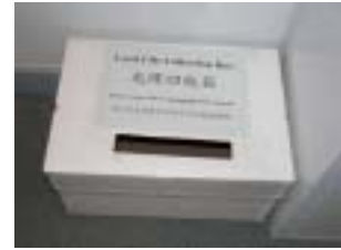
Used CD collection box