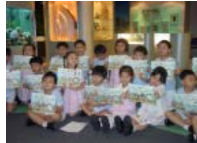
Endangered Species Resource Centre

The Endangered Species Resource Centre continued to serve as the site to promote public awareness of the need for the protection of endangered species. During the year, over 5 800 visitors visited the Resource Centre.