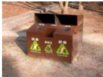
Recycle bin in Country Parks

Park visitors were encouraged to separate their rubbish such as plastic bottles and aluminum cans and put them into different bins.