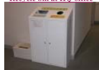
Recycle bin at HQ office