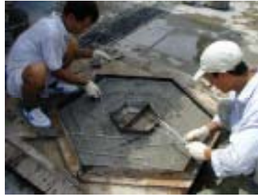
Reuse of barbecue forks