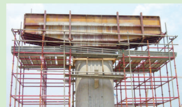
採用金屬模板以減少建築廢料 Use of metal formwork to reduce construction waste