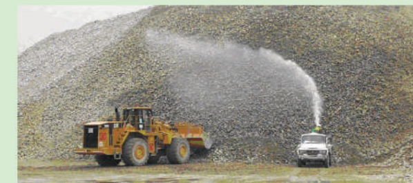
在搬運物料前於物料儲存區灑水 Water spraying at stockpile area before removal