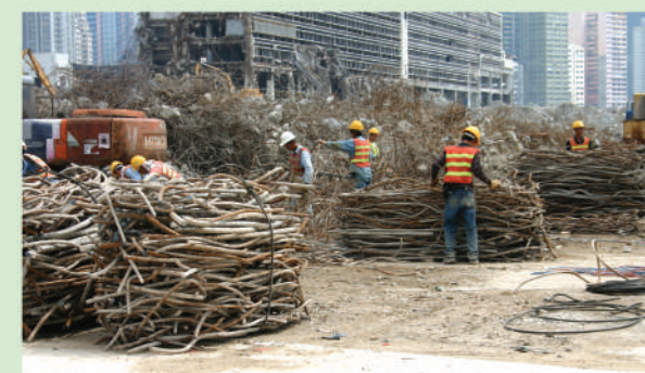
分類處理拆卸物料以供循環再用 Sorting of demolition materials for recycling

為盡量減少在公眾填料接收設施和堆填區卸置的拆建物料數量，我們要求承建商必須推行工地廢物管理計劃。我們定期監察承建商的表現，確保他們有效實施計劃建議的措施。此外，我們透過各種推廣計劃，鼓勵承建商實施革新的工地廢物管理策略和措施。