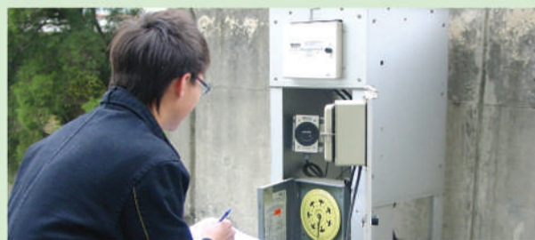
環境監察小組進行空氣質素監察 Air Quality Monitoring by Environmental Team

我們為《環境影響評估條例》涵蓋的指定工程項目實施環境監察及審核計劃，以密切監察承建商的環保表現，並確保承建商實施環境影響評估報告指定的緩解措施。