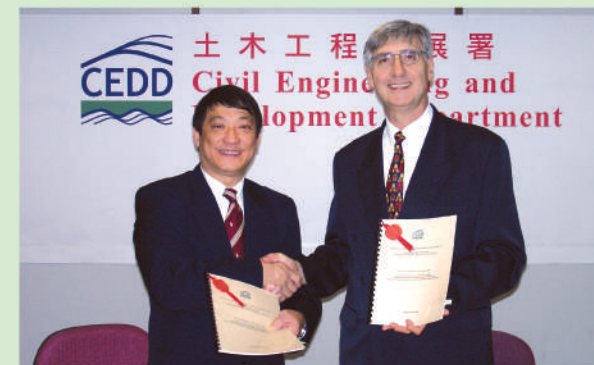
簽訂綜合管理系統的顧問合約 Signing of Consultancy Agreement for the Integrated Management System

In order to enhance the environmental performance in all the functions and processes, we decided in mid 2005 to extend the scope of the EMS to cover the whole department. To manage the current QMS and the extended EMS more effectively and efficiently, the two management systems will be combined to form an Integrated Management System (IMS) with a single set of documented procedures that fulfils the requirements of both ISO 9001:2000 and ISO 14001:2004. We commissioned Hong Kong Productivity Council in December 2005 to develop and implement a documented IMS. We have targeted to implement the IMS in September 2006 and obtain ISO 14001:2004 Certification for the whole department in mid 2007.