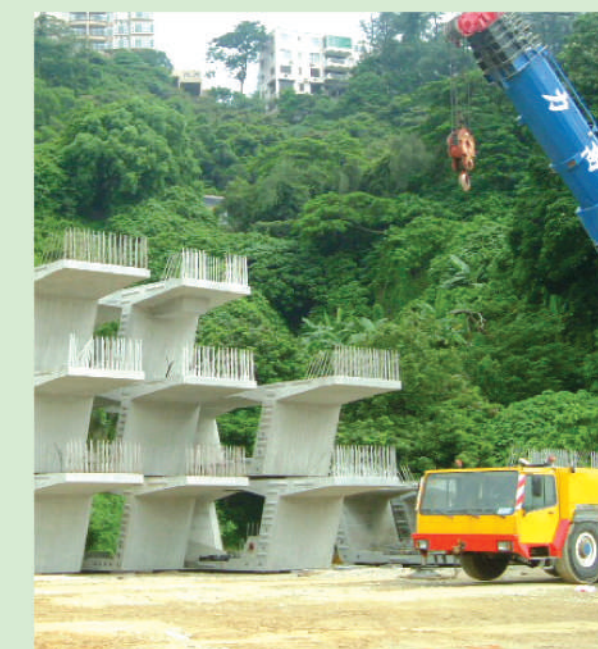
採用預製組件以減少建築廢料 Use of precast elements to reduce construction waste

To minimize the disposal of C&D material to public fill and landfill sites during construction, our contractors are required to implement waste management plans (WMPs) on sites. We monitor the performance of the contractors regularly to ensure that the measures proposed in the WMPs are implemented effectively. In addition, our contractors are encouraged through various promotion schemes to implement innovative waste management strategies and measures on sites.