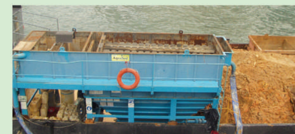
沉澱池處理工地產生的廢水 Sedimentation tank to treat wastewater generated on site

During the construction stage, we monitor the performance of our contractors to ensure their compliance with environmental requirements. We also ensure that they implement adequate measures to mitigate the environmental impacts arising from the works.