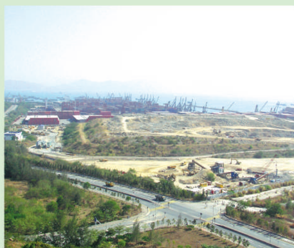
屯門填料庫 Tuen Mun Fill Bank

在2005年，公眾填料接收設施和堆填區總共接收約1050萬公噸拆建物料，當中約800萬公噸屬公眾填料。