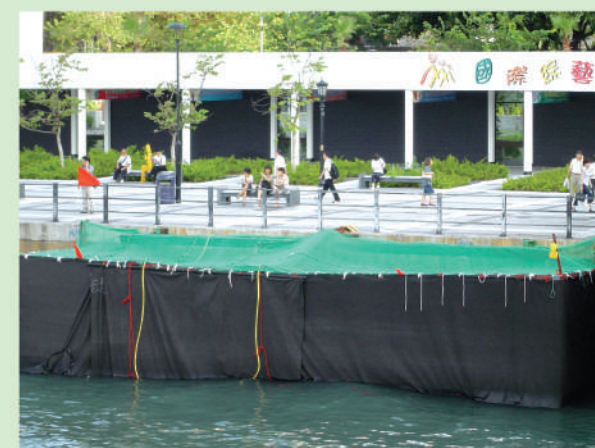
在冷卻水抽水站進口水口安裝隔泥篩 Silt screen at the water intake of a cooling water pump station

在施工期間，我們監察承建商的表現，確保他們遵守環保規定，並實施適當的措施以緩解工程對環境構成的影響。