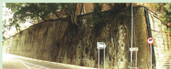
在擋土牆鞏固工程中採用泥釘可保留現存樹木 Existing trees are retained after upgrading works using soil nails

我們已完成長有樹木的砌石牆的研究。研究提出用以評估樹木對砌石牆穩定性影響的方法。研究也建議了妥善的方法，以鞏固不符合安全標準的舊砌石牆，同時保存牆上的樹木及外貌。