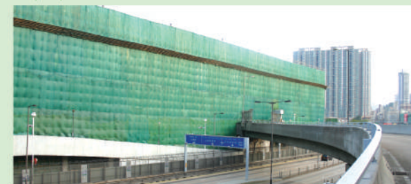
竹棚架上的帆布防止泥塵到處飄揚 Tarpaulin sheets attached to bamboo scaffoldings to prevent dust emissions