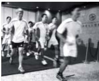
An HKMA Corporate Team participates in the Run-up Two IFC Charity Race.

The HKMA bought suitable office supplies from a workshop staffed by people with physical disabilities. The electronic Christmas card of the HKMA was designed by a charitable organisation for the visually impaired.