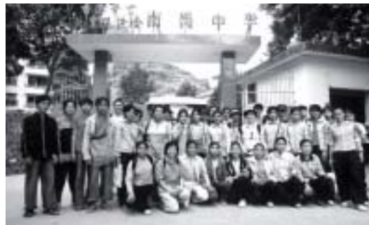
An HKMA Volunteer Team visits the school children in Liannan, a hilly area in Guangdong.