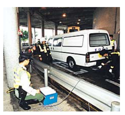
Traffic police have stepped up action against smoky vehicles in support of new intiatives by the HKSAR Government.

1. Energy Conservation in Existing Buildings — The difficult task of incorporating