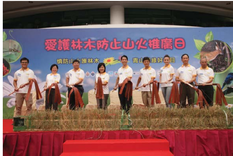
二零一一年消防處「愛護林木防止山火推廣日」開幕禮 The Opening Ceremony of 'Zero Hill Fire Scheme' 2011

their undertaking. In 2011, 573 villages had successfully hit the target of “Zero Hill Fire” and were awarded. We were pleased to note that the number of participating villages has been increased yearly since the launching of the scheme in 2007, indicating that the scheme received recognition.