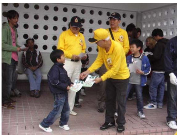
消防屬員向掃墓的市民派發防止山火的宣傳單張 FSD staff Distributing leaflets on Hillfire Prevention to gravesweepers

their undertaking. In 2008, 445 villages had successfully hit the target of “Zero Hill Fire” and were awarded.