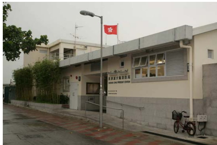
長洲滅火輪消防局 Cheung Chau Fireboat Station

The statutory duties of FSD are to protect life and property against fire and other calamities, provide emergency ambulance service and give advice on fire protection measures for the community. As at 31.12.2008, there were 8,792 uniformed members and 630 civilian staff working in the Department. We managed 78 fire stations, 36 ambulance depots, 5 office-based workplaces, 4 fire appliance workshops, 2 training schools and the West Kowloon Rescue Training Centre. The newly built Cheung Chau Fireboat Station was put into operation in October 2008. To carry out our duties, the Department operated a fleet of 849 fire appliances, ambulances and supporting vehicles plus a fleet of 22 fire boats and support vessels.