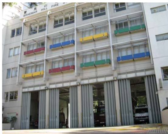
Folding gates at Fire Station installed with noise mitigation measure

☆ to reduce the noise generated from the operation of folding doors, variable speed drivers had been installed as a mitigation measure on all the existing automatic folding doors. Moreover, Planning Group of this Department had also included such device in the design of all new fire stations and ambulance depots. With the installation of such device, this Department had received no complaint in 2008 regarding the noise caused by automatic folding doors.