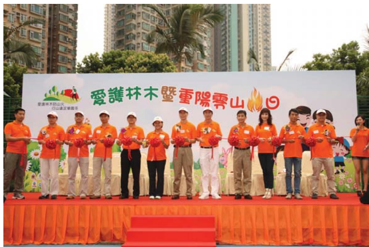
二零一零年消防處「愛護林木暨重陽零山火日」開幕禮 The Opening Ceremony of 'Zero Hill Fire Scheme' 2010

had successfully hit the target of “Zero Hill Fire” and were awarded. We were pleased to note that both the number of participating villages and the number of villages hitting the target had been increased yearly since the launching of the scheme in 2007, indicating that the scheme received recognition.